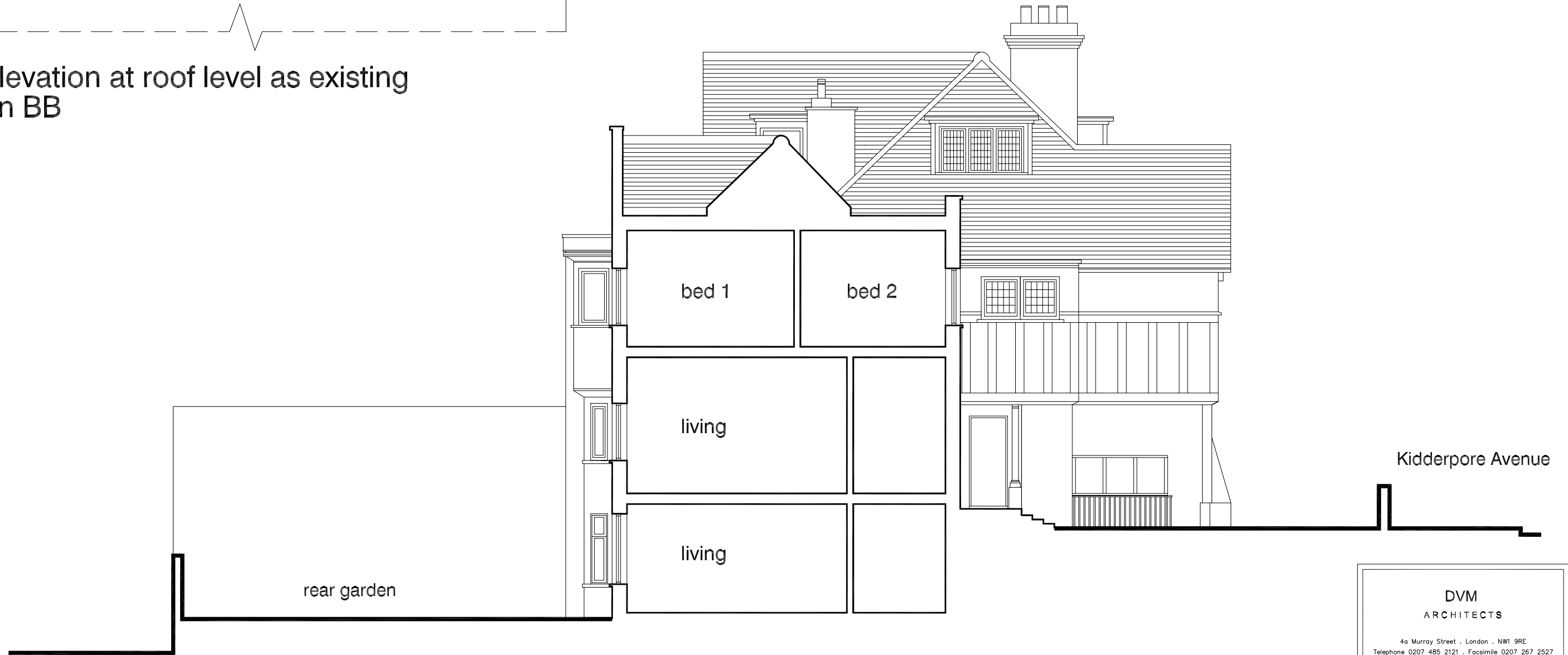
Sectional Elevation AA as existing

DVM ARCHITECTS 4a Murray Street . London . NW1 9RE Telephone 0207 485 2121 . Facsimile 0207 267 2527 e-mail: studio@dvmarch.com