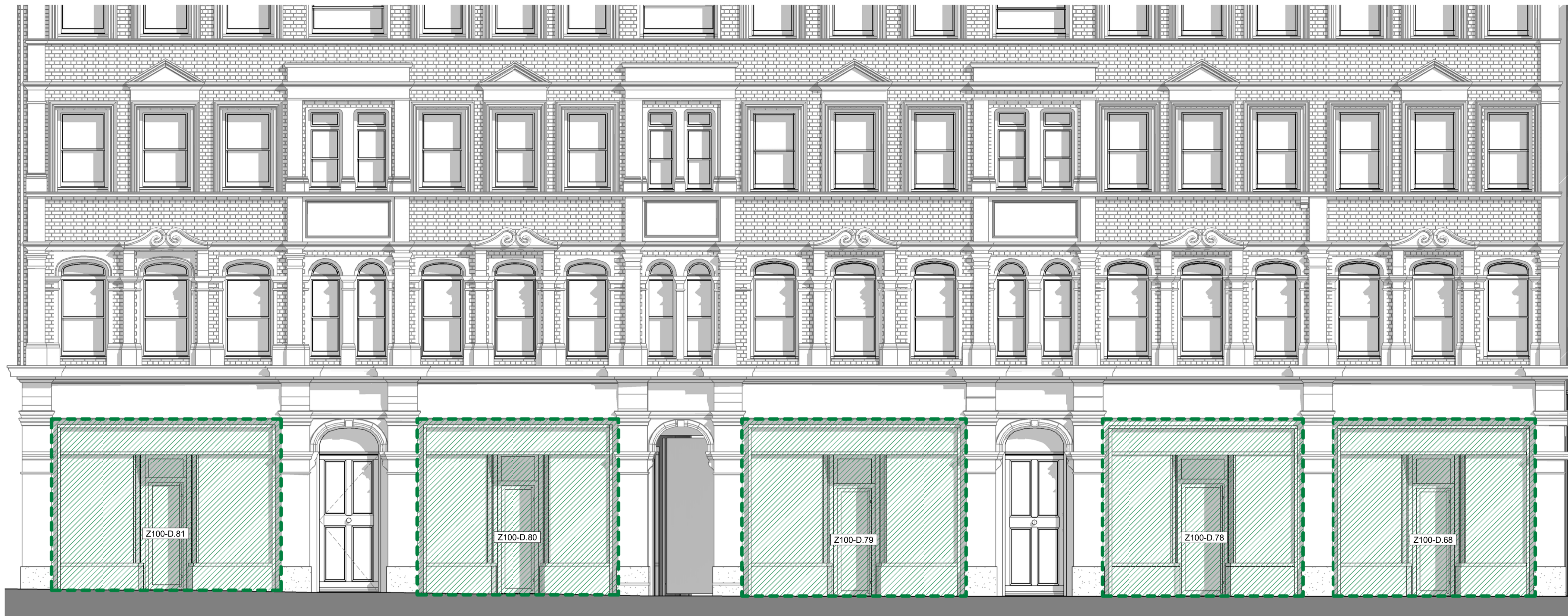
1 St Giles High Street - Level 00 - Shopfront Elevation Scale: 1 : 50