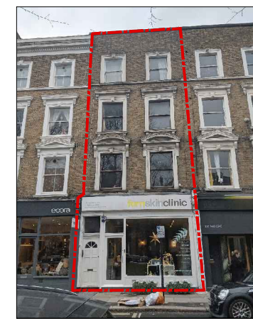
4. FRONT/STREETSCENE ELEVATION