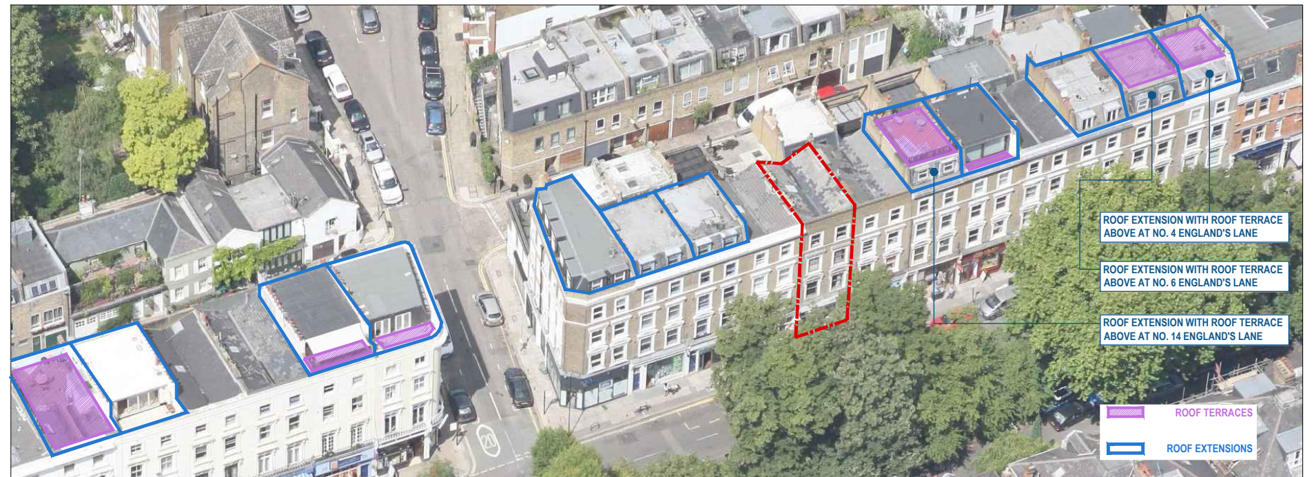
AERIAL PERSPECTIVE - SOUTH ELEVATION ALONG ENGLAND'S LANE