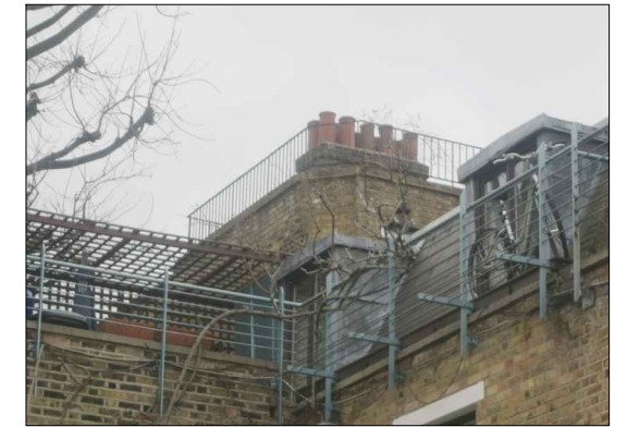
3. REAR ELEVATION OF ROOF EXTENSION INCORPORATING A ROOF TERRACE WITH PERIMETER RAILINGS