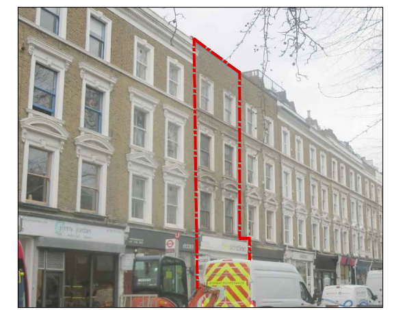
5. STREETSCENE PERSPECTIVE DEMONSTRATING NEIGHBORING ROOF EXTENSIONS