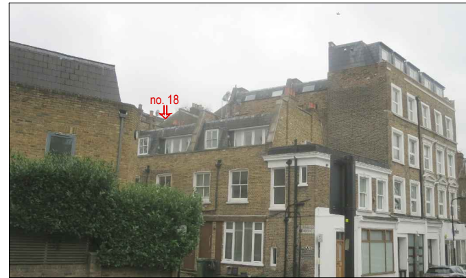
1. REAR ELEVATION OF PARADE