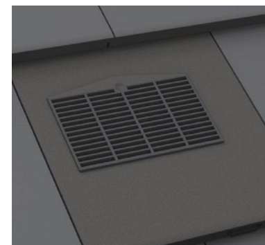
Opt 2 - Roof Vent