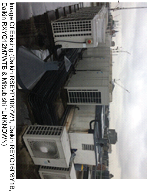
Image Of Existing (Daikin RSEYR10K7W1, Daikin REYQ16P8Y1B, Daikin RXYQ12M7WTB & Mitsubishi *UNKNOWN)