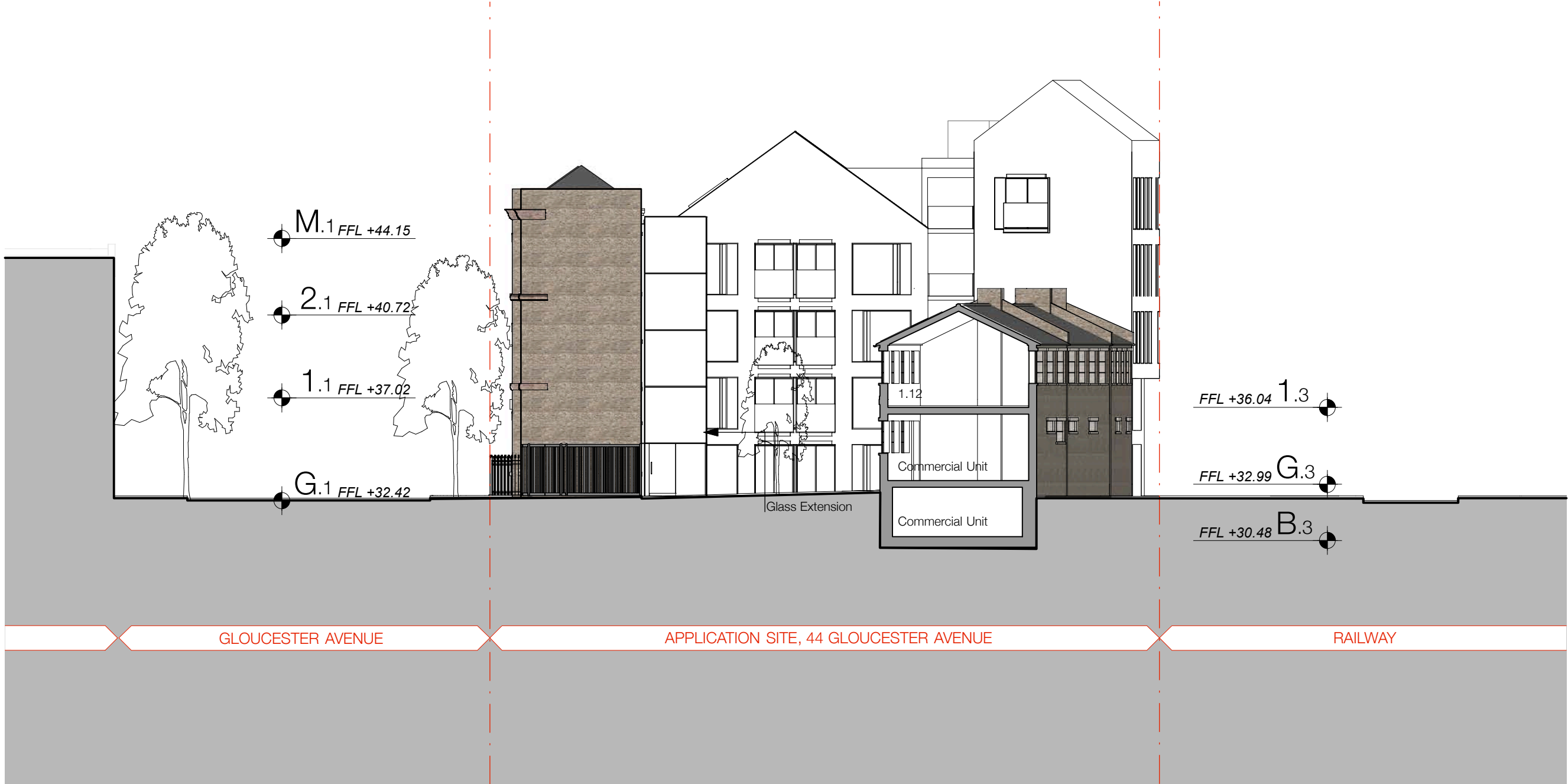
A GS.00 Proposed Section DD 1:100 @A1 1:200 @A3