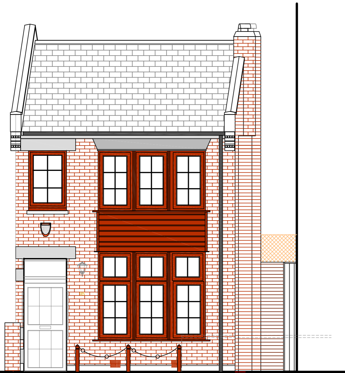
front elevation existing