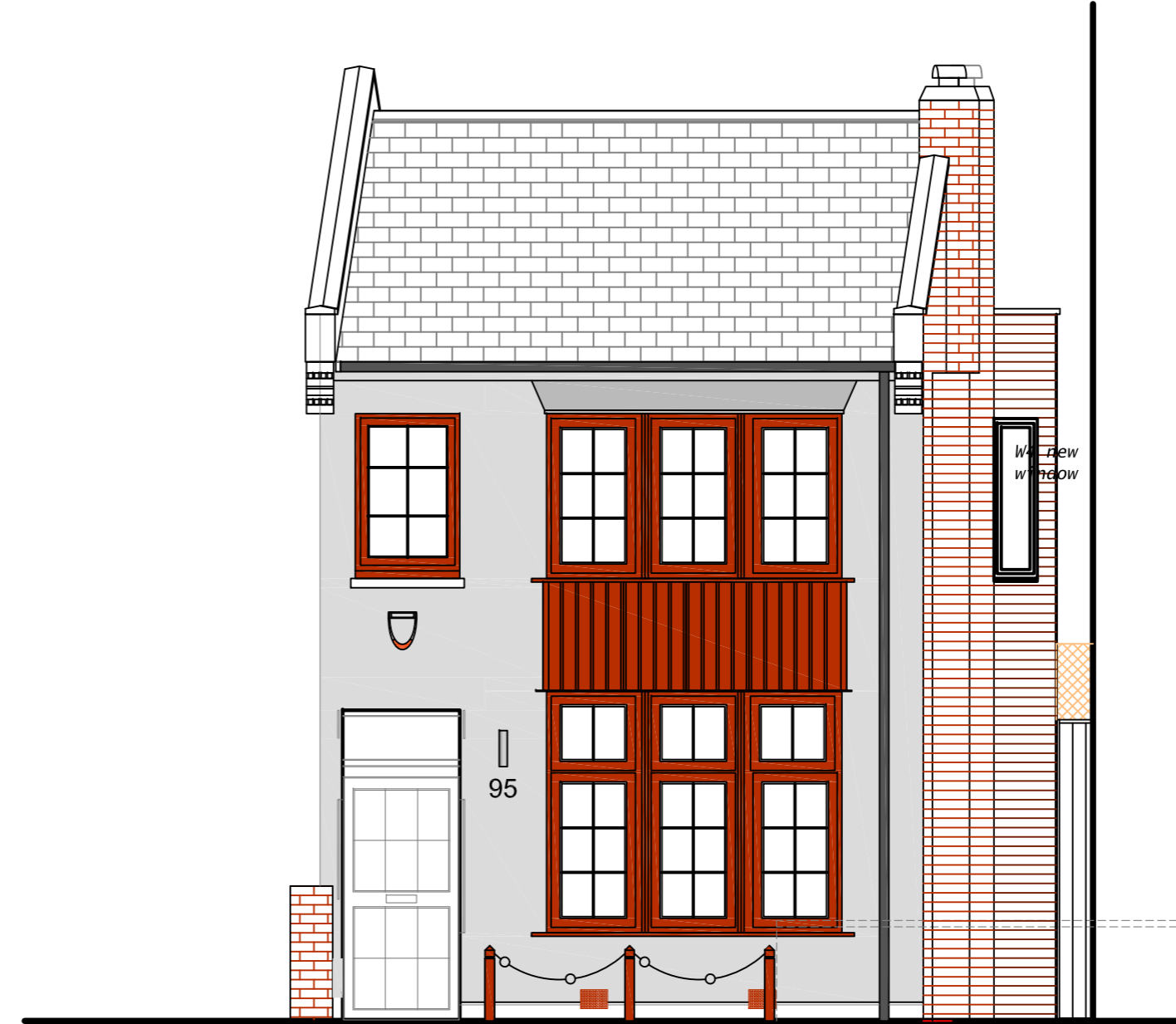
front elevation proposed