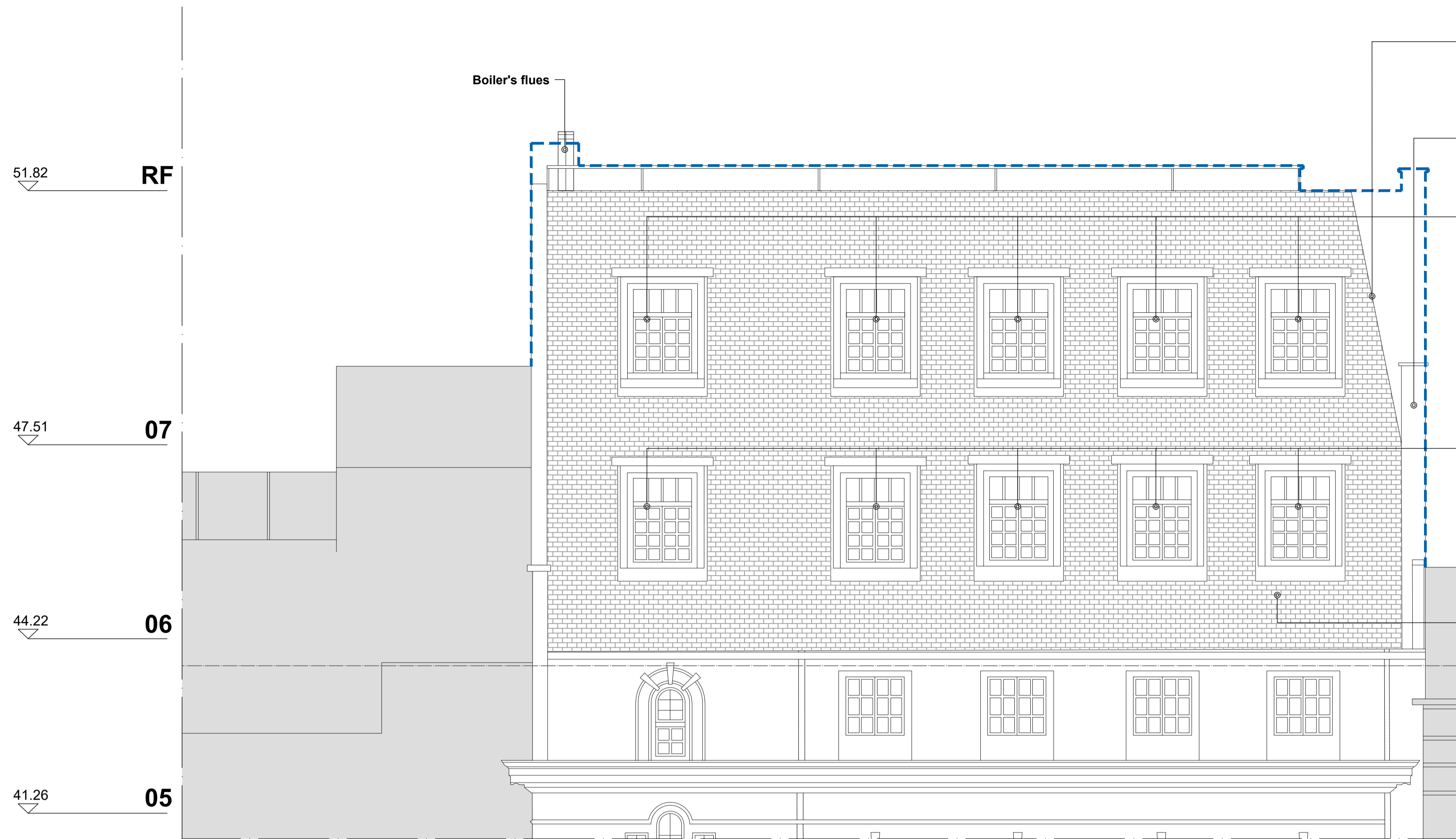
01 Proposed Wild Court Elevation Scale 1/50