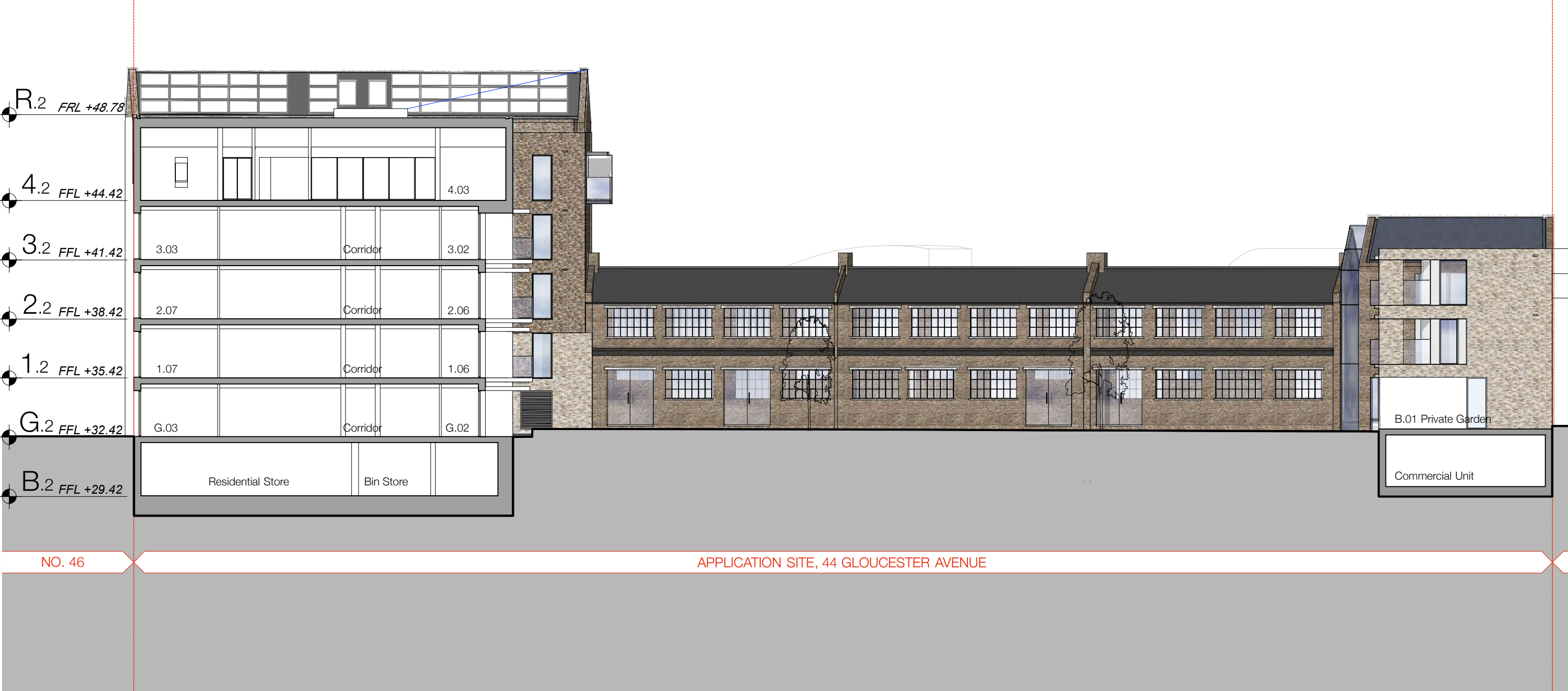
A GS.03 Proposed Section AA 1:100 @A1 1:200 @A3