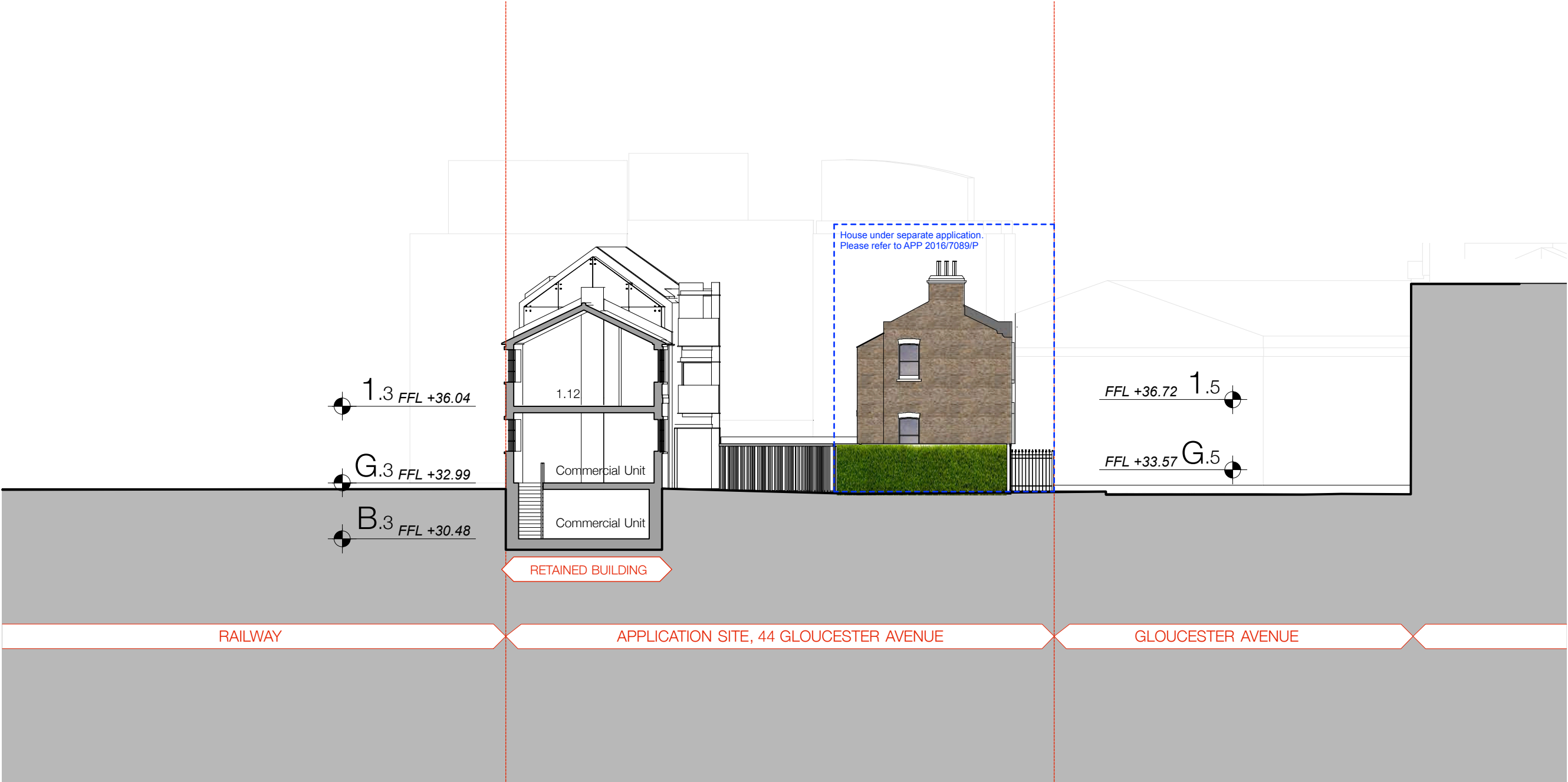
Proposed Section BB GS.02 1:100 @A1 1:200 @A3

Information contained within this drawing is the sole copyright of 21st Architecture Ltd. and is not to be reproduced without express permission. No implied licence exists. This drawing not to be used for land transfer or valuation purposes. Do not scale from this drawing. All dimensions & levels are to be checked on site by the contractor. Issued for purposes indicated only. Drawing errors and omissions to be reported to the architect.