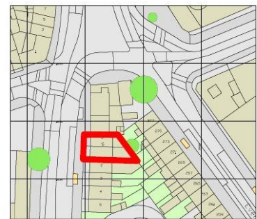
Block plan 1/1250