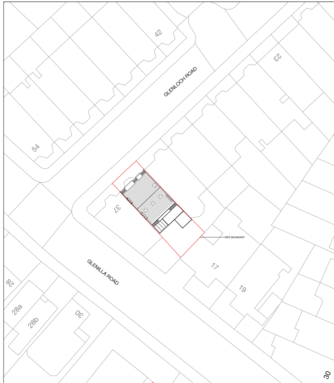
Existing Block Plan