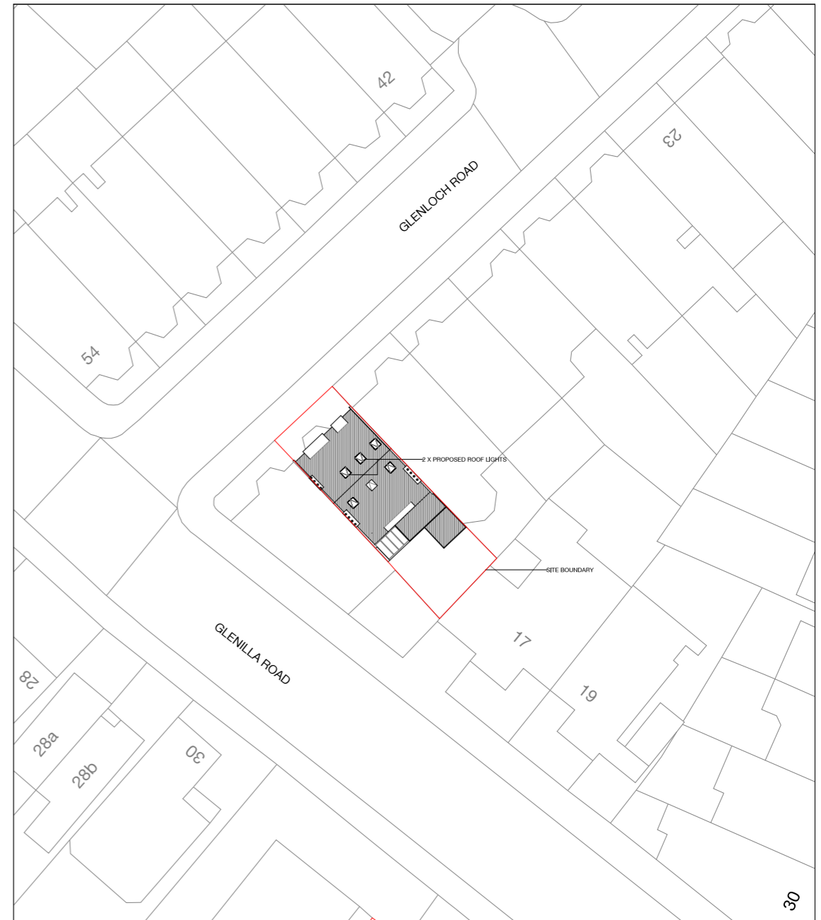
Proposed Block Plan