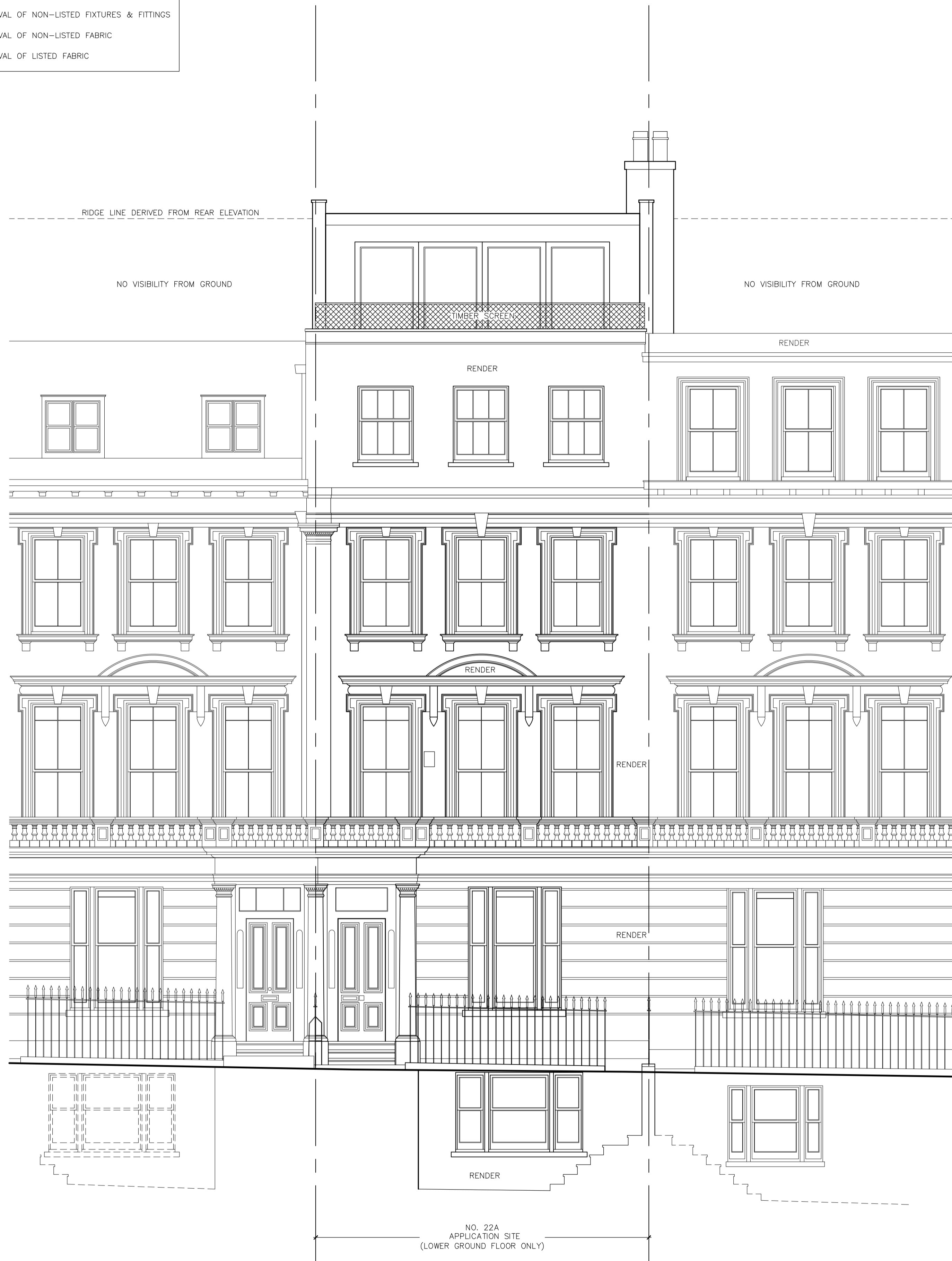
SOUTH-WEST ELEVATION (FRONT)