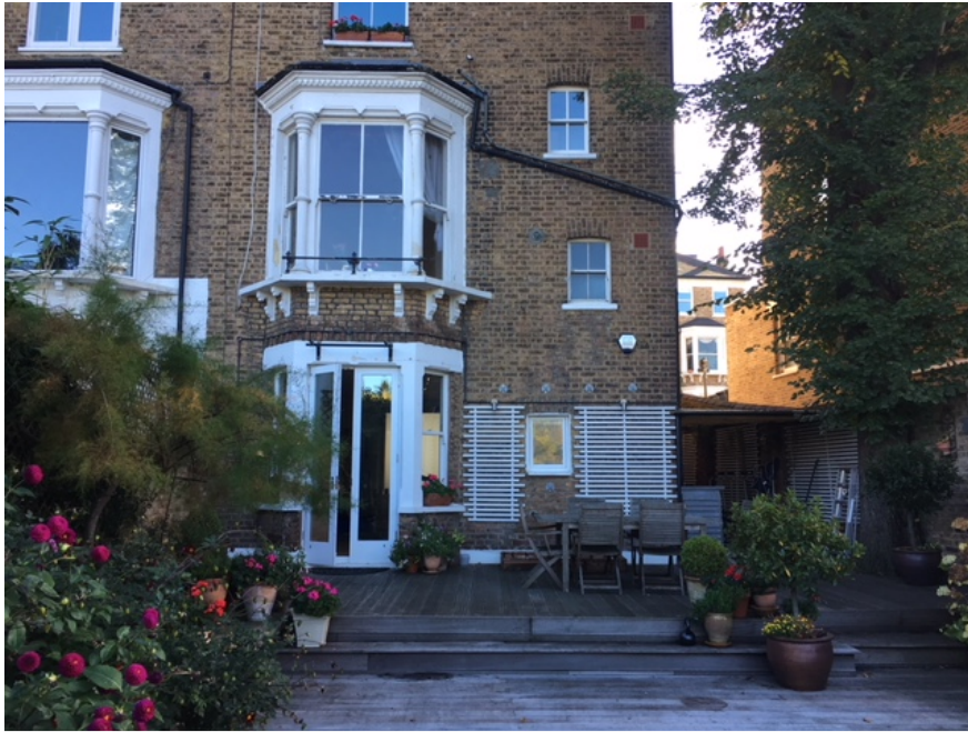
Photos 1, 2 and 3 show existing rear elevation