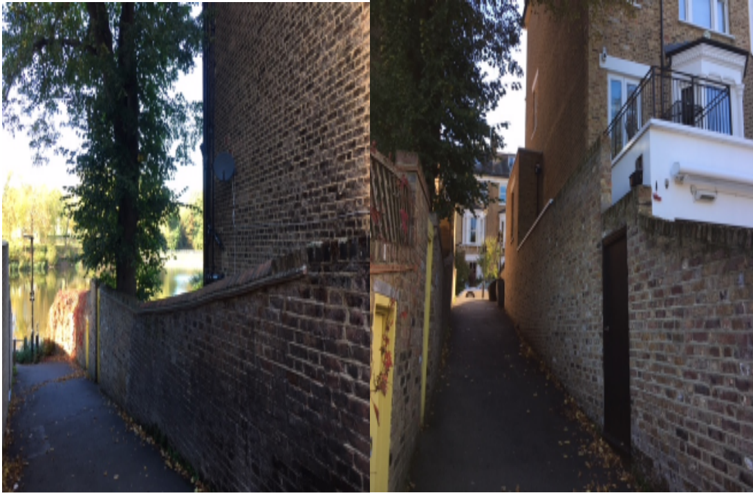
Photos 11, 12 and 13 below show the view down towards the heath and side elevation.