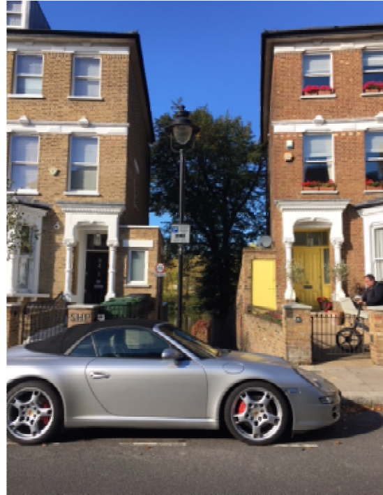
Photos 7 and 8 are views from the front, photos 9 and 10 below are the side elevations from the front.