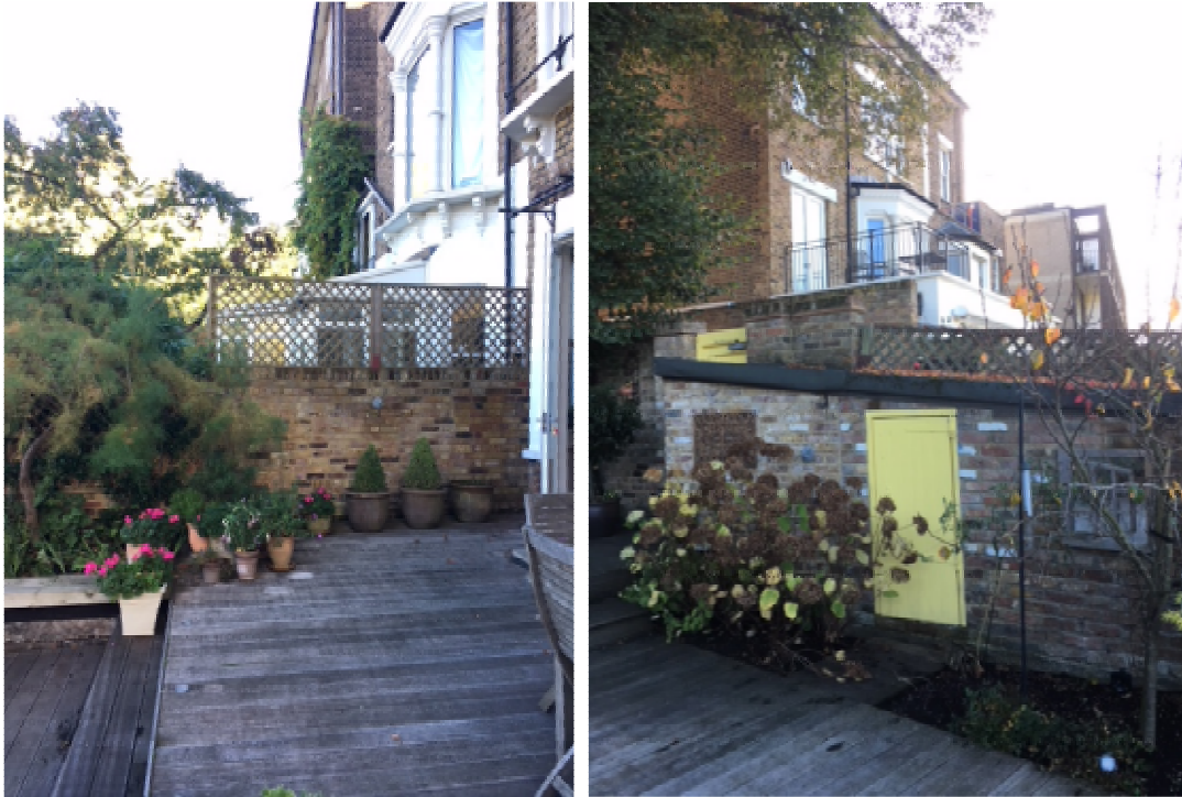
Photos 4 and 5 above show views towards shared boundaries with Nos.94 and 98 South Hill Park.