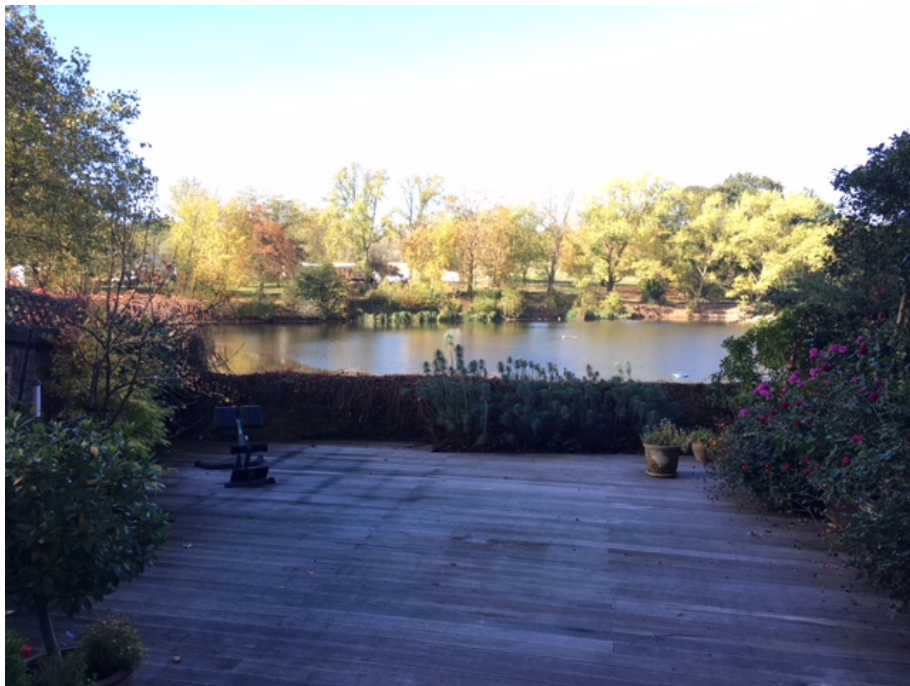
Photo 6 shows the rear view towards the Heath.