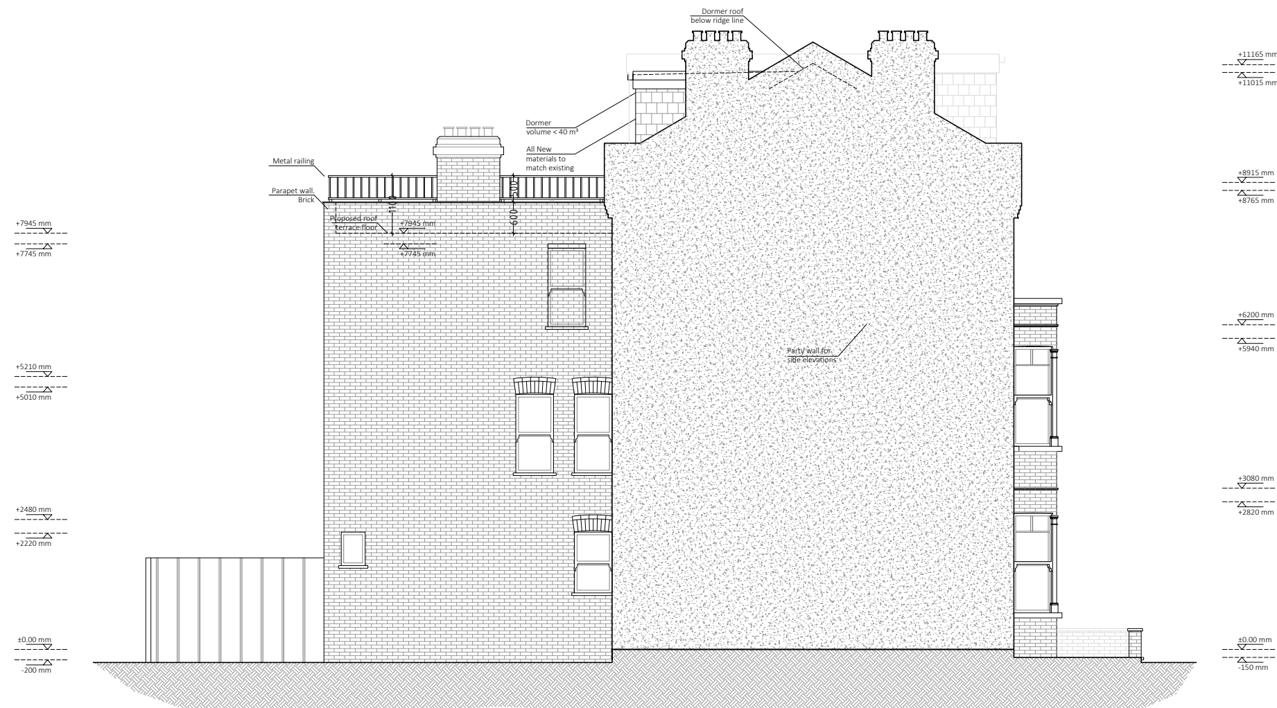
PROPOSED EAST SIDE ELEVATION

+11165 mm +11015 mm +8915 mm +8765 mm +6200 mm +5940 mm +3080 mm +2820 mm ±0.00 mm -150 mm