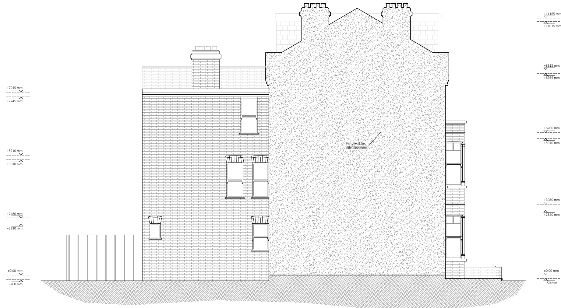
EXISTING EAST SIDE ELEVATION