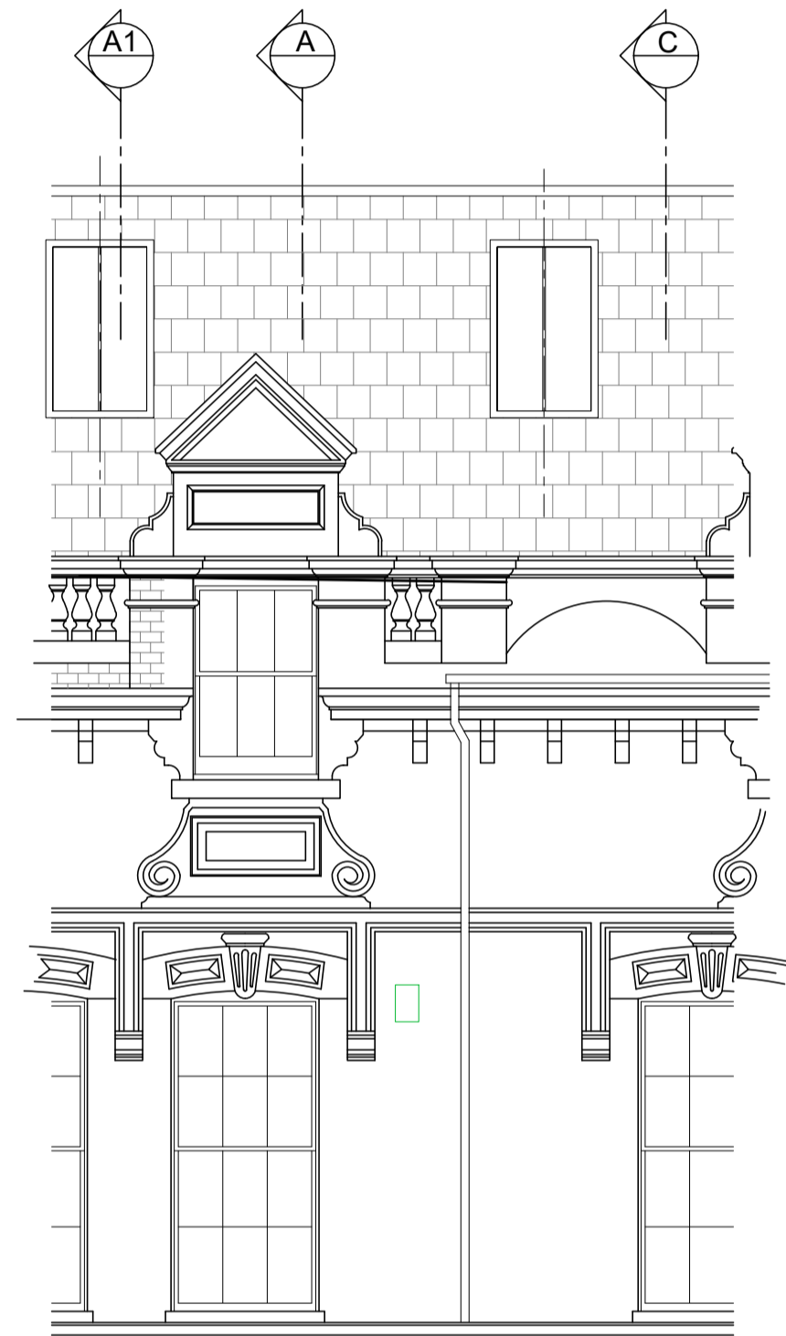
3 Partial Front Elevation 1