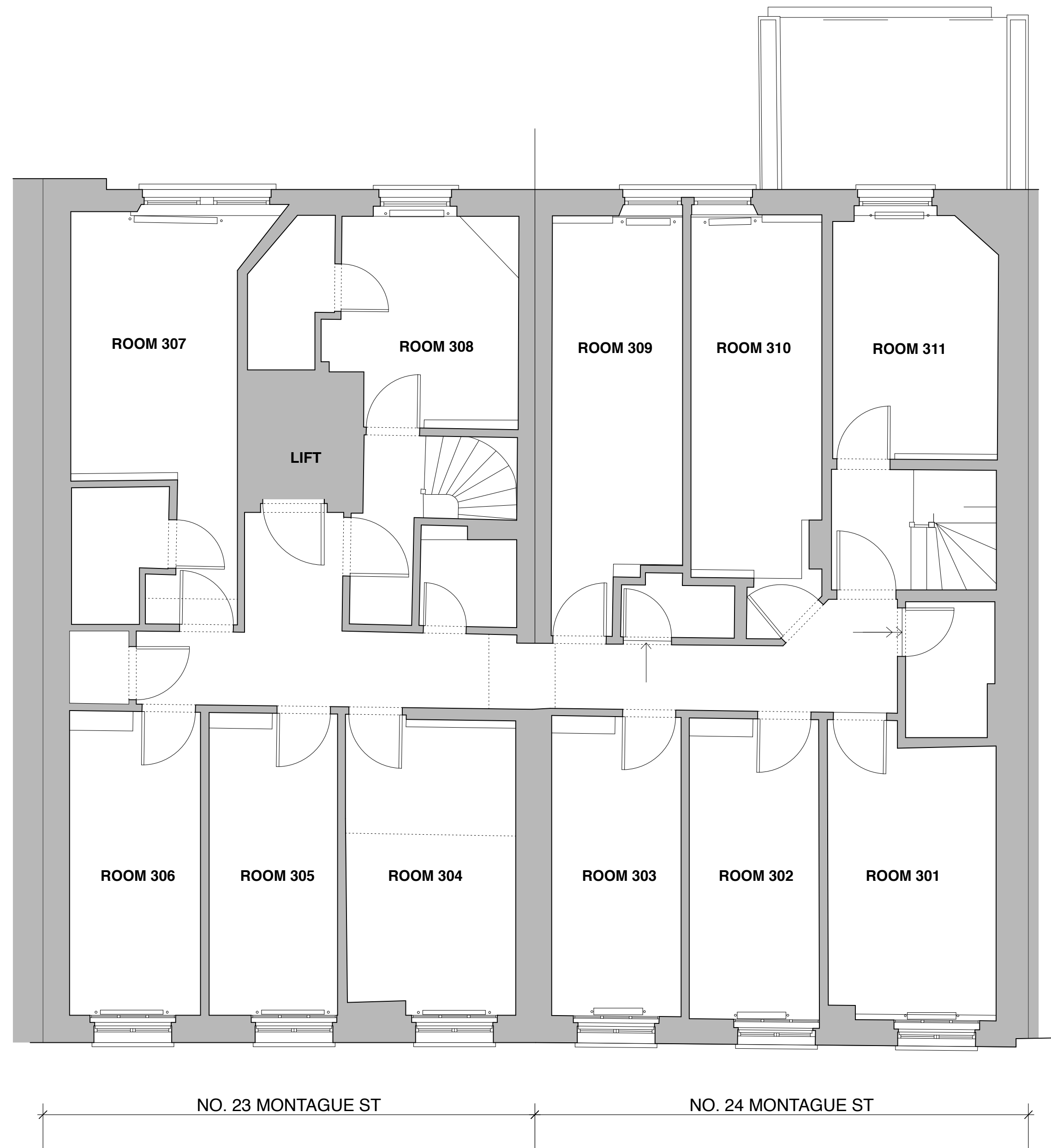
EXISTING THIRD FLOOR PLAN