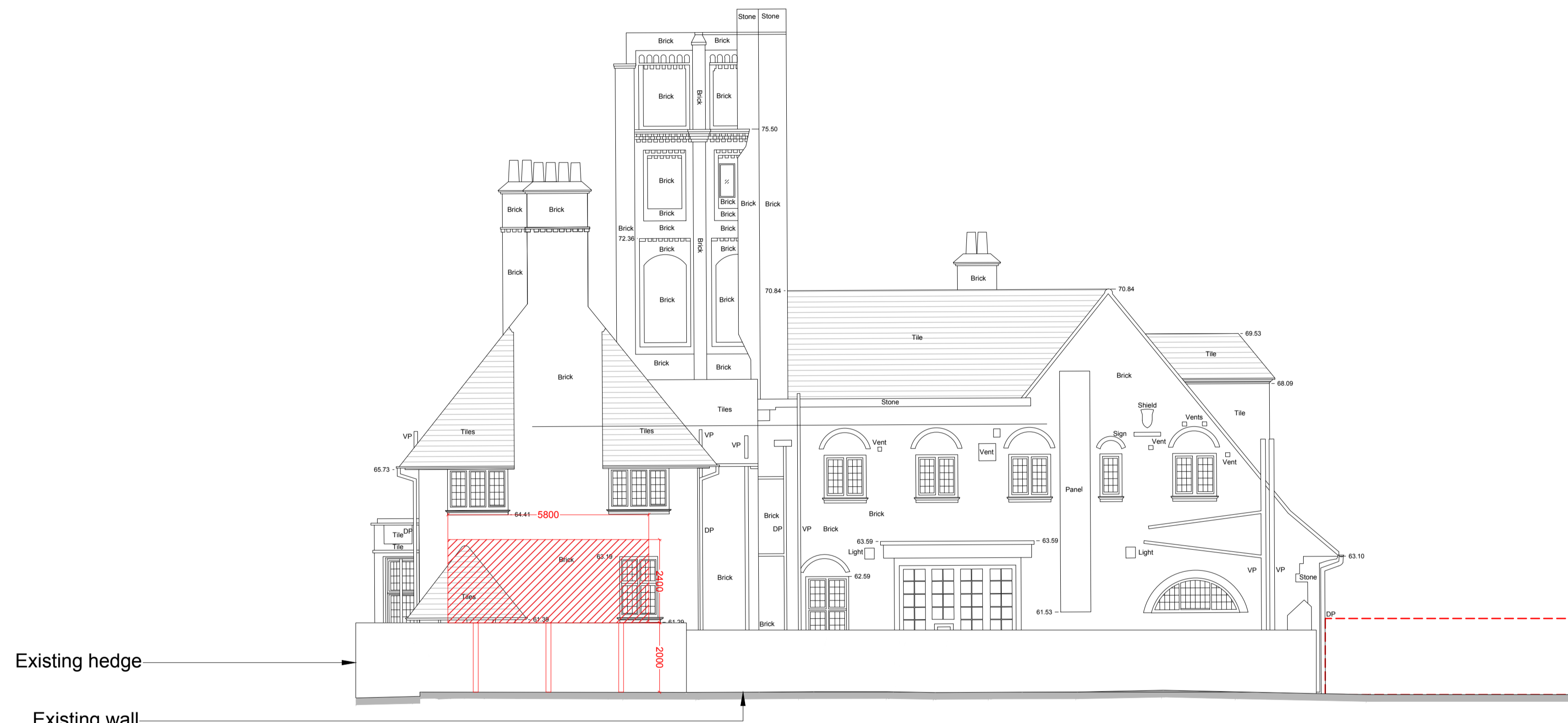
1 - EAST ELEVATION