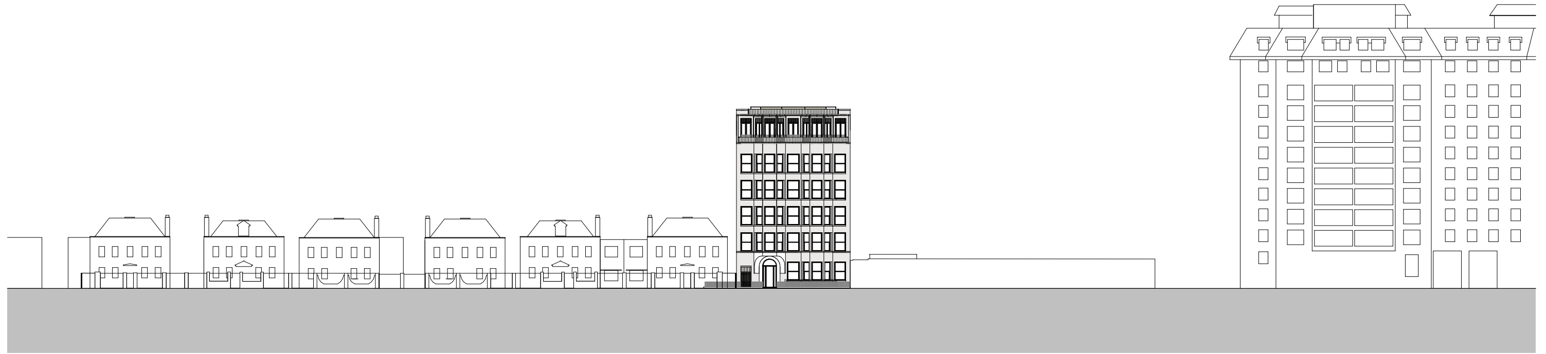
Proposed St John's Wood Park Elevation