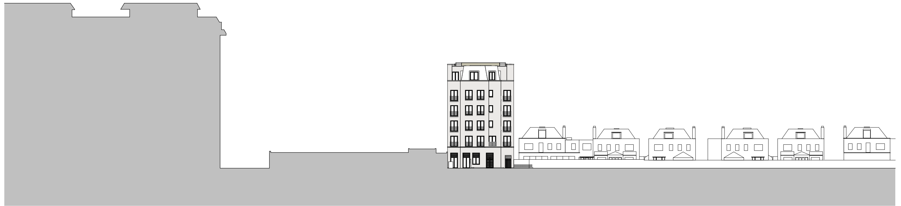
Proposed Middlefield Elevation

Do not scale from this drawing. Verify all dimensions on site. Drawing should be read in conjunction with information from all other design consultants and contractors. All drawings in digital format are for reference only, paper copies are available on request.