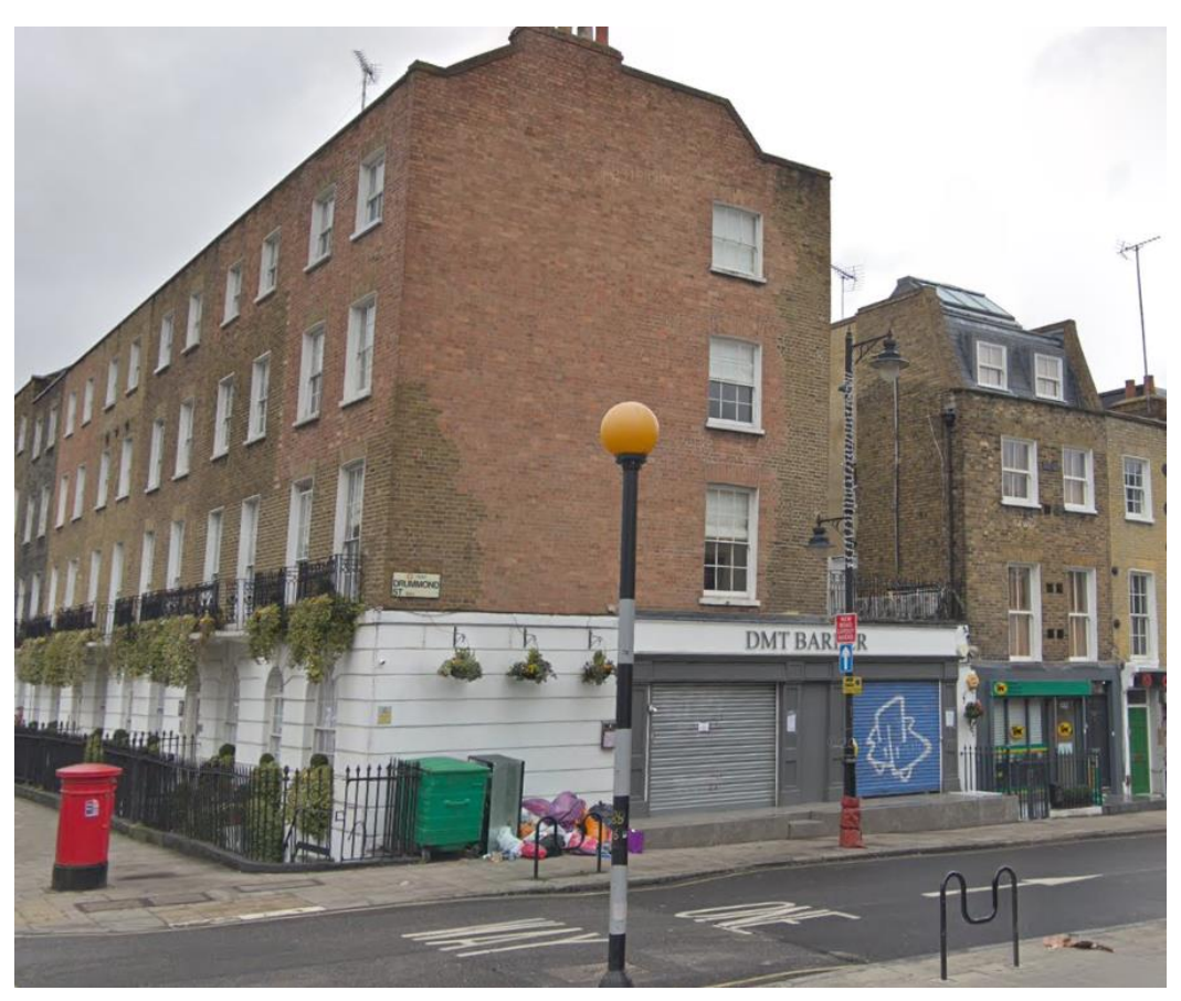
Corner of Drummond Street and North Gower Street