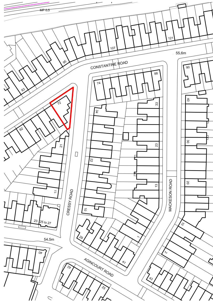
LOCATION PLAN 1:1250 scale