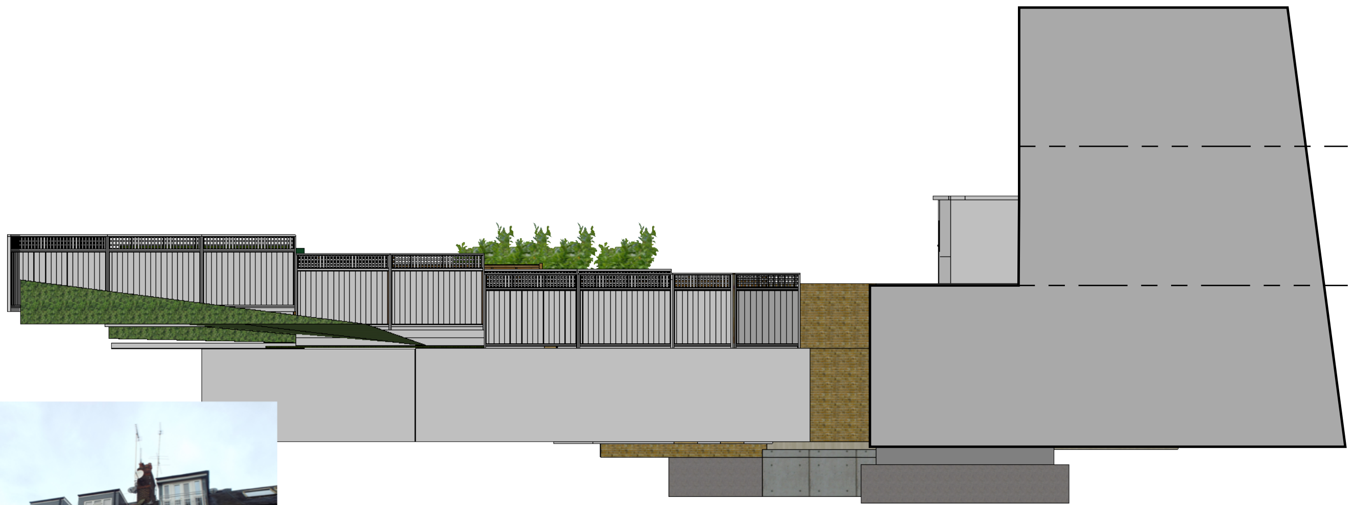
EXISTING ELEVATION FROM GARDEN OF FLAT 2, 8 FROGNAL