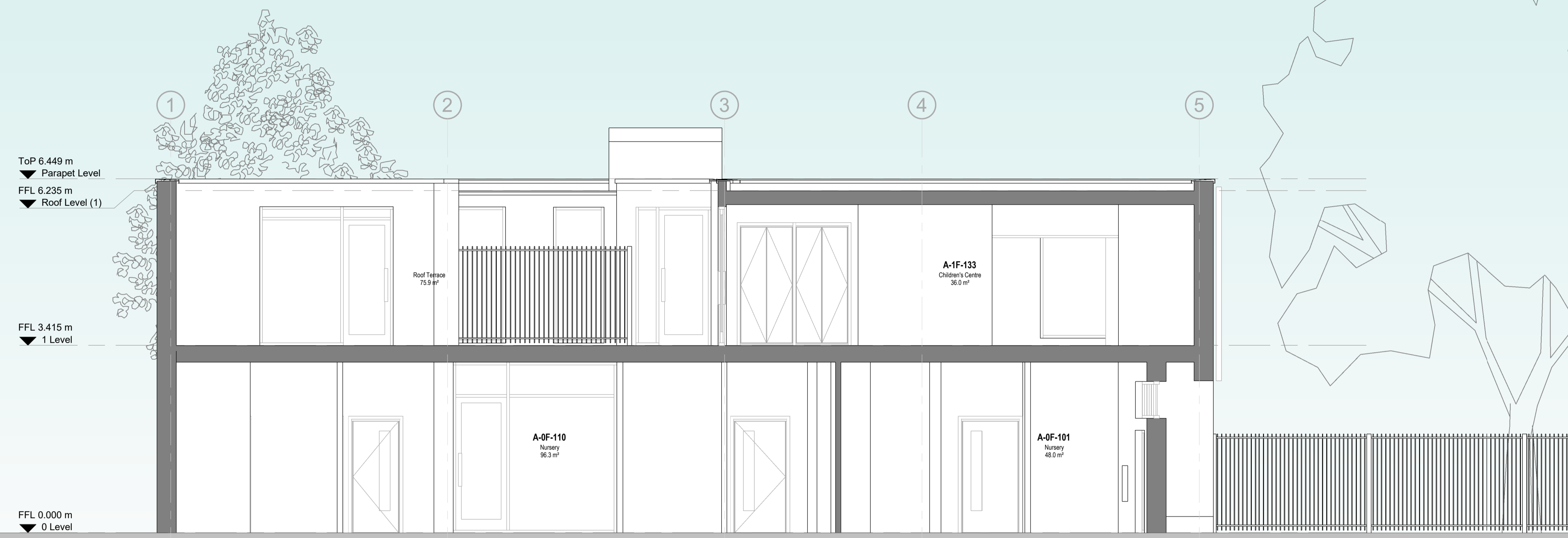
1 Existing Section C 0602 1 : 50

It is assumed that all works will be carried out by a competent contractor working, where appropriate, to an approved method statement