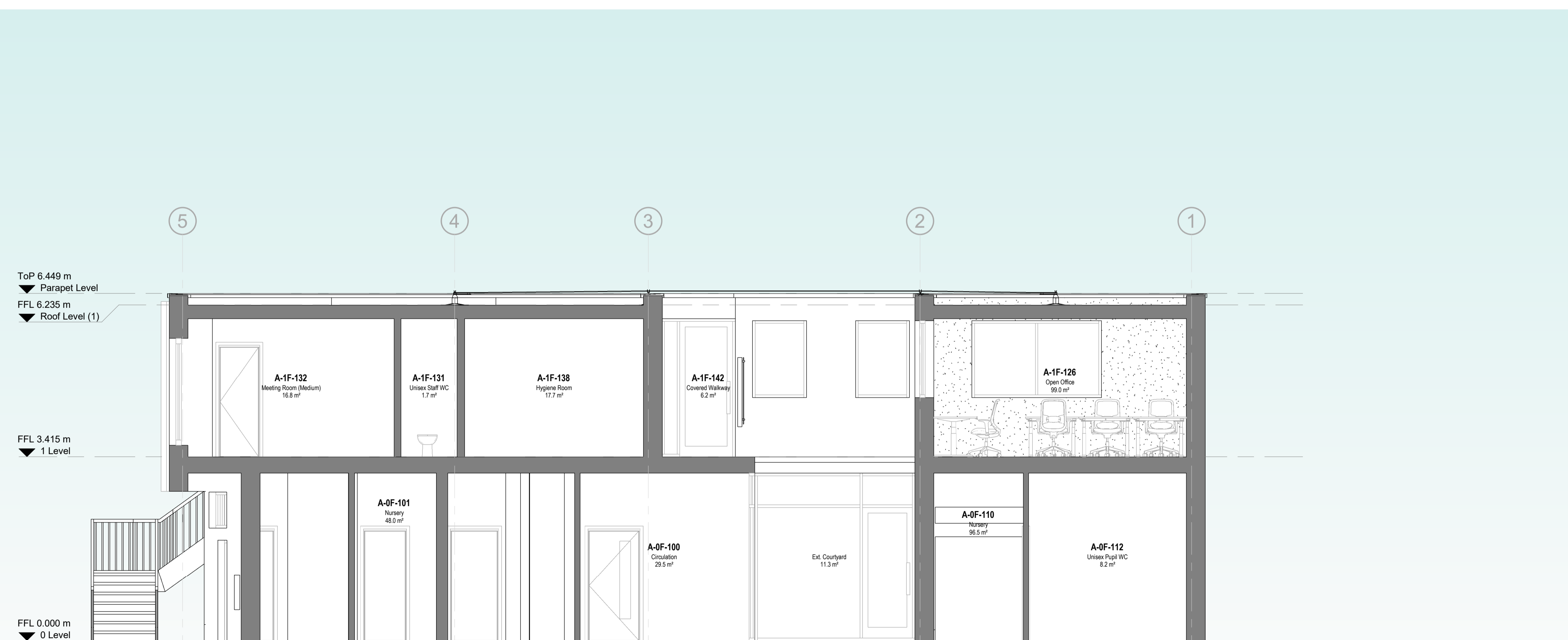
2 Proposed Section D2 0652 1 : 50