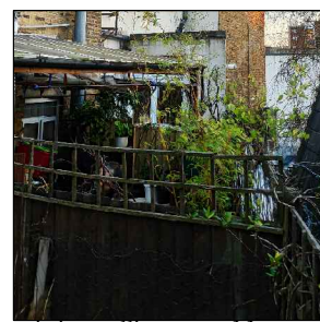
existing trellis to top of fence

SC Design Property Developer & Planner Contact : +44 7979437664 E-mail : samcheung33@hotmail.com