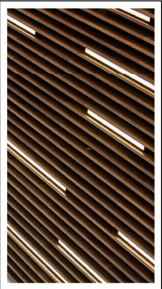
PRECEDENT RECESSED LINEAR LED IMAGE