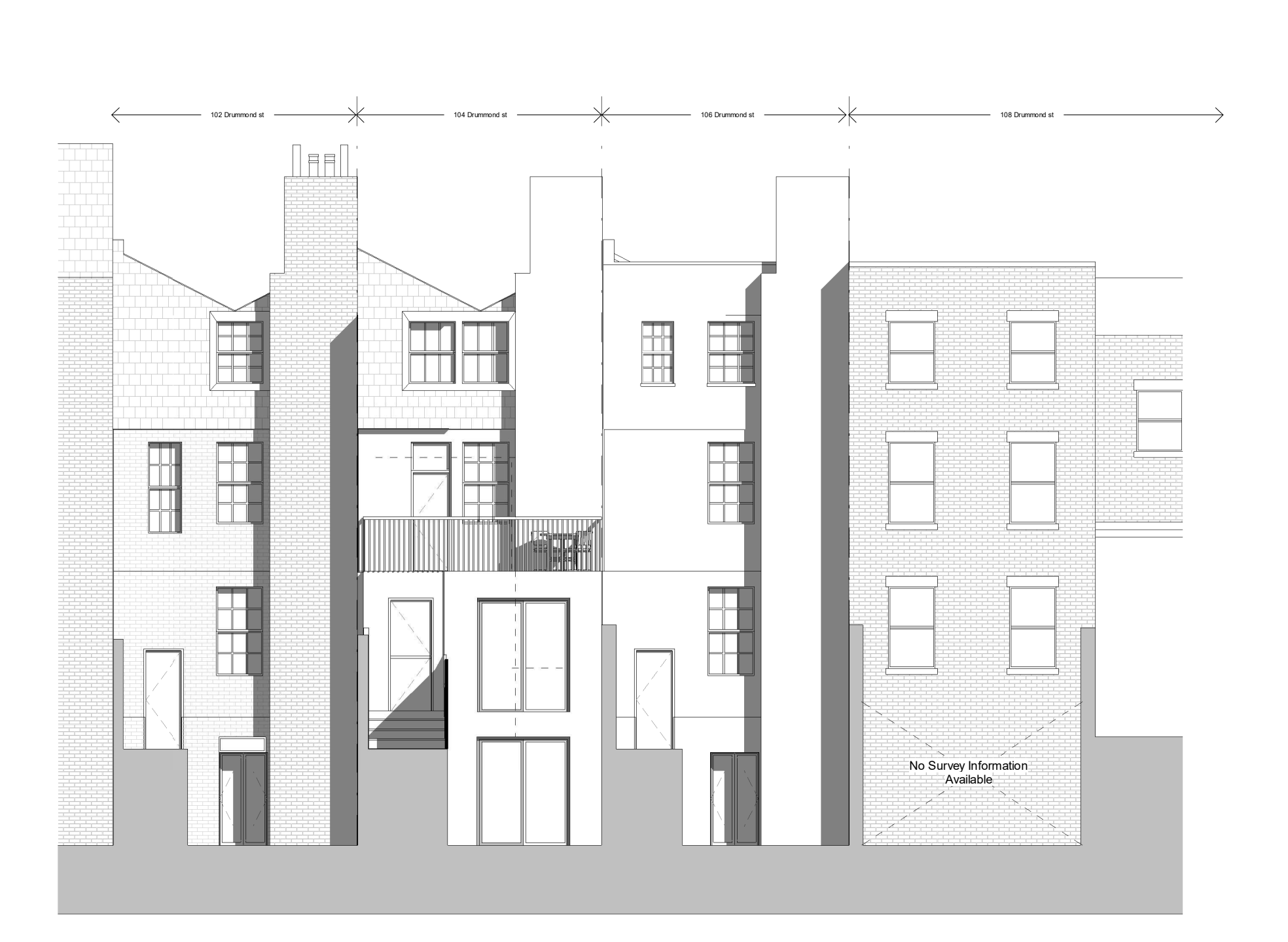
Proposed Rear Elevation Context

Drawing Notes 1. This drawing is prepared solely for design and planning submission purposes. It is not intended or suitable for either Building Regulations or Construction purposes and should not be used for such. 2. All dimensions must be checked on site and any discrepancies verified with the architect. 3. Unless shown otherwise, all dimensions are to structural surfaces.