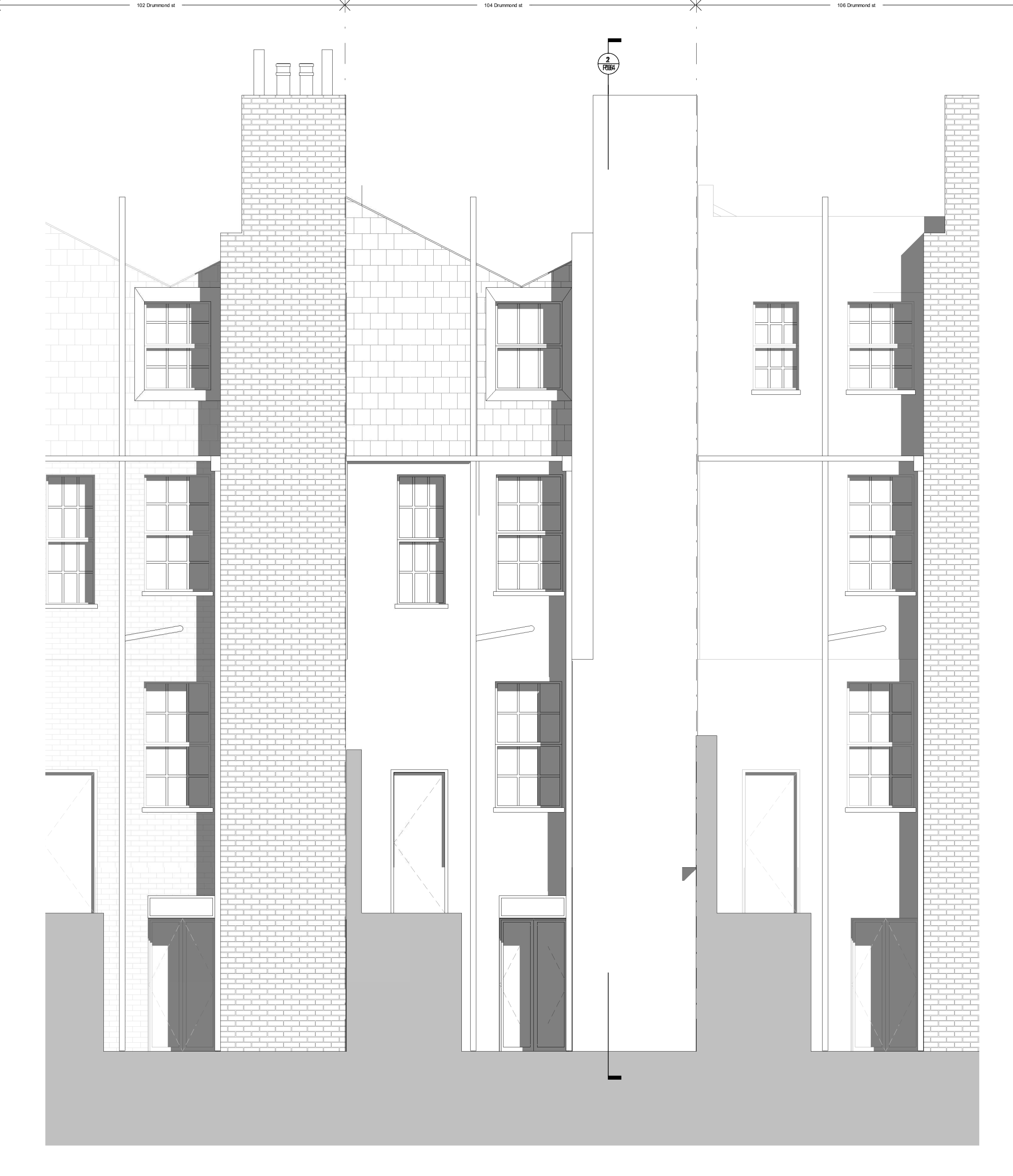
Existing Rear Elevation 2