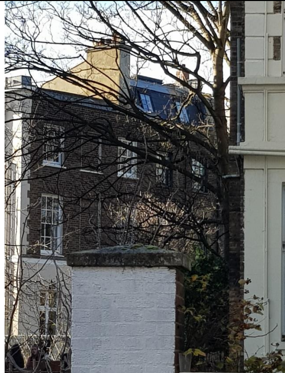
Photo 2 roof seen from Gloucester Avenue February 2019