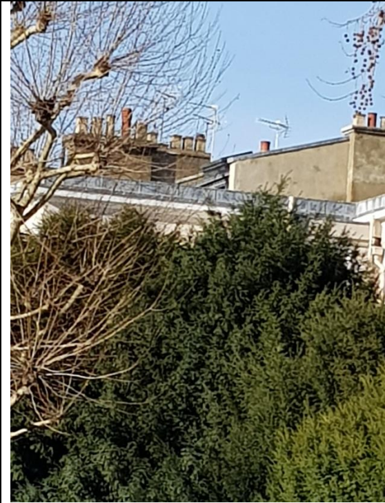
Photo 1 roof seen from Regent's Park Road February 2019