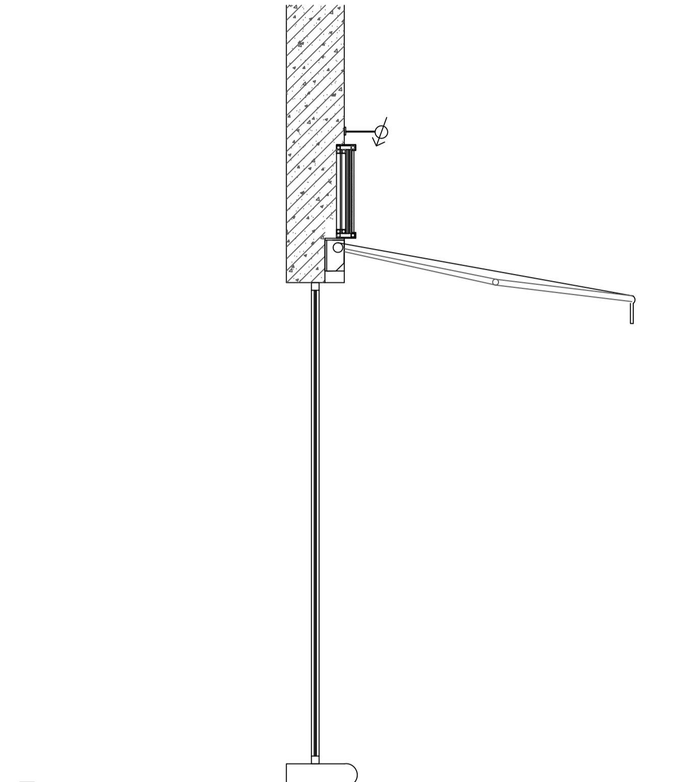
EXISTING SECTION A-A SCALE 1:20