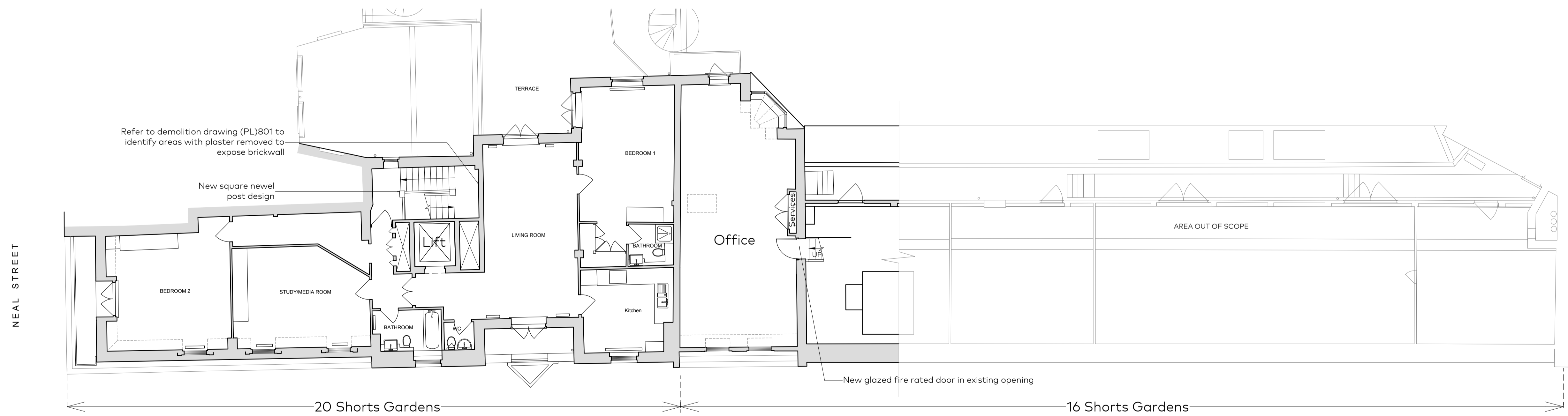
02 PROPOSED THIRD FLOOR PLAN 1:100@A1