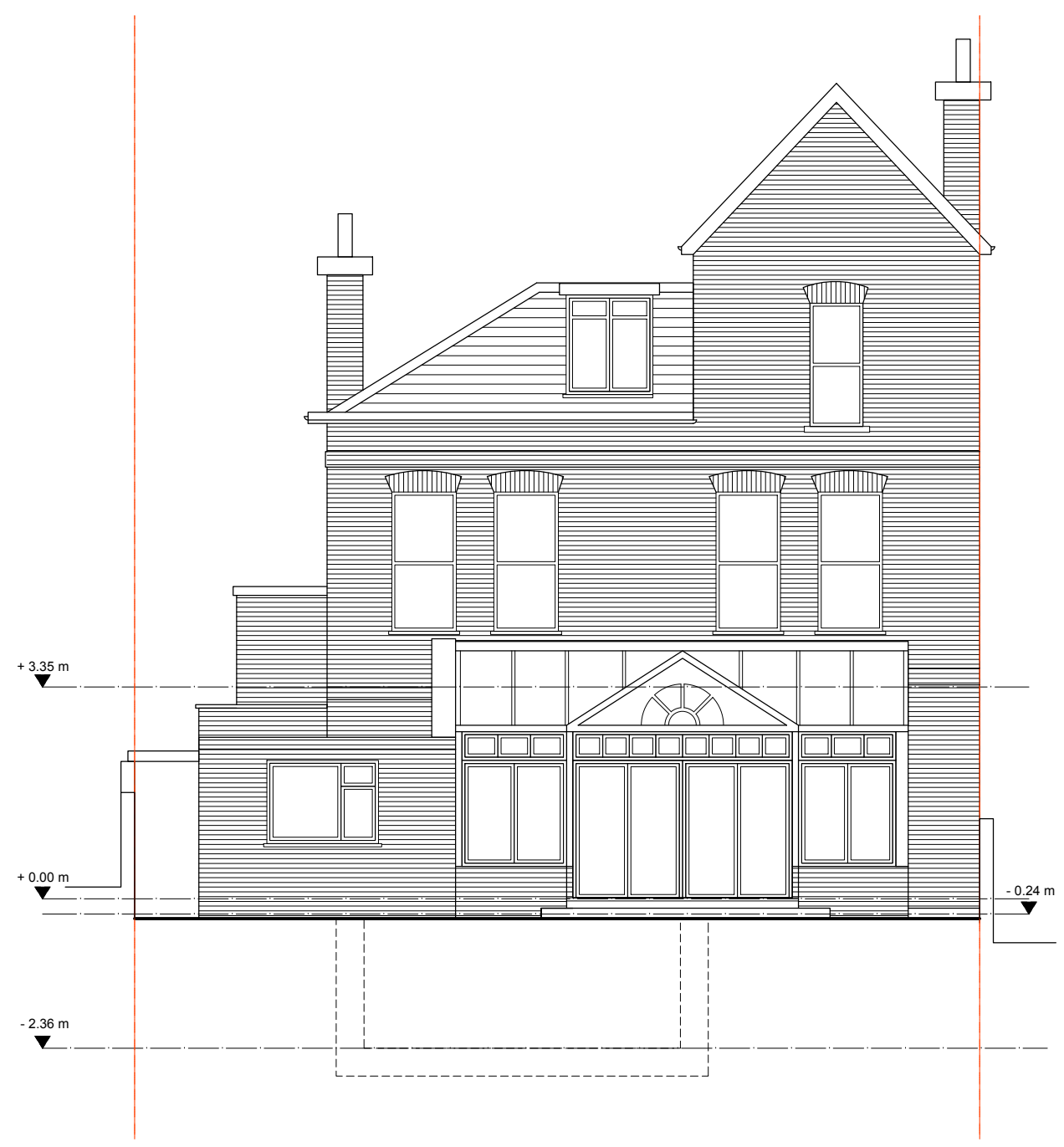
2 REAR ELEVATION - EXISTING Scale: 1:100