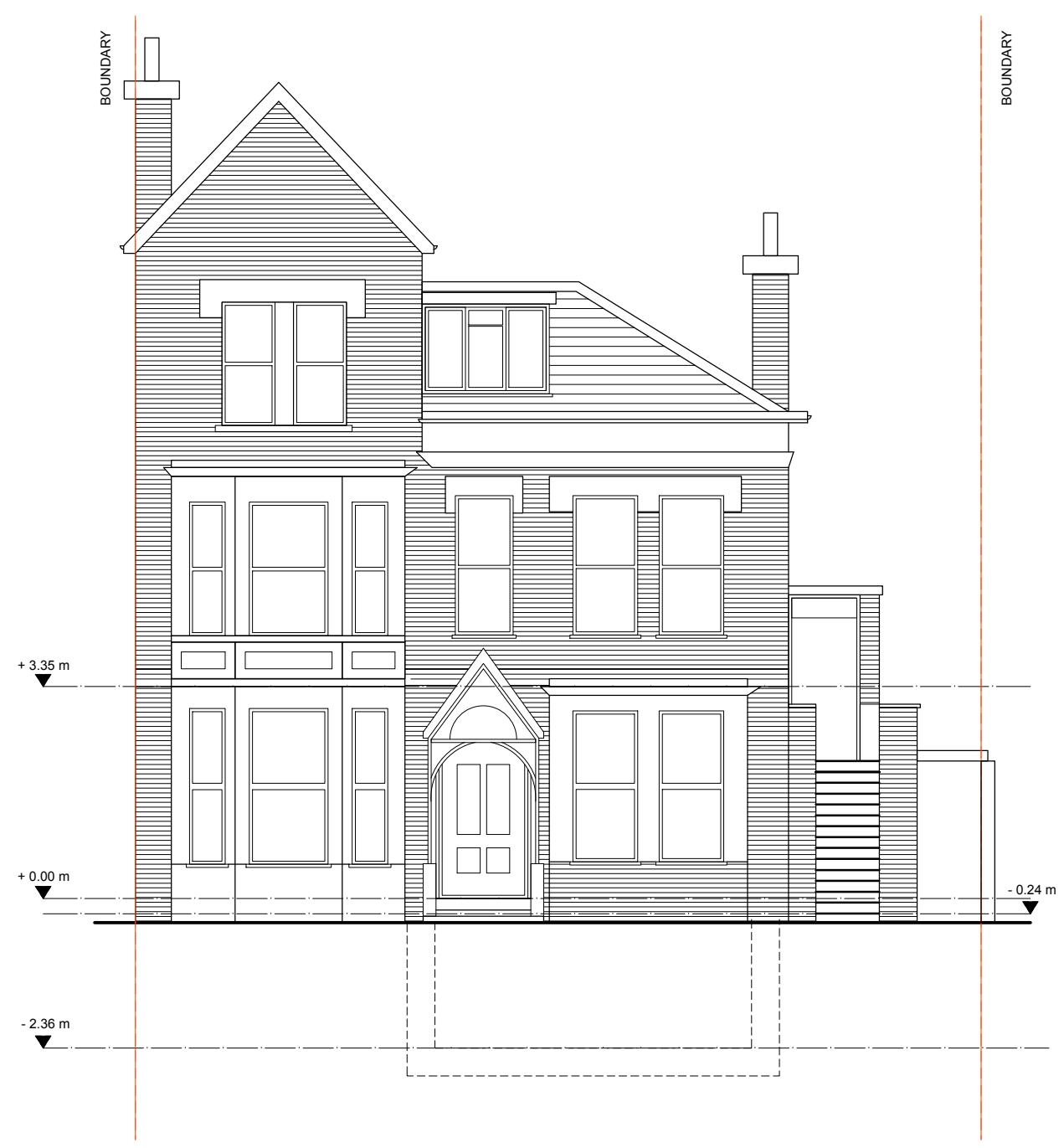
1 FRONT ELEVATION - EXISTING Scale: 1:100

General Notes: 1. Copyright: this drawing cannot be reproduced without the consent of the owner; 2. Do not scale from this drawing. All dimensions are to be checked on site; 3. All dimensions, levels and drain lines to be checked on site prior to commencement of work. Any discrepancies should be brought to the designers attention.