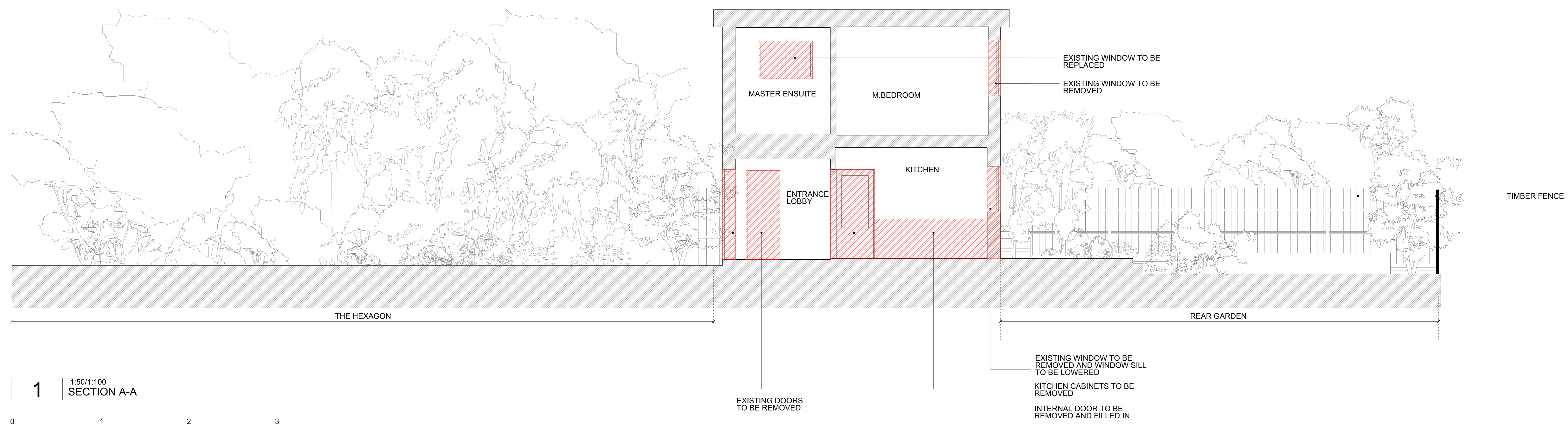
1 1:50/1:100 SECTION A-A SCALE IN METRES @ 1:50/1:100