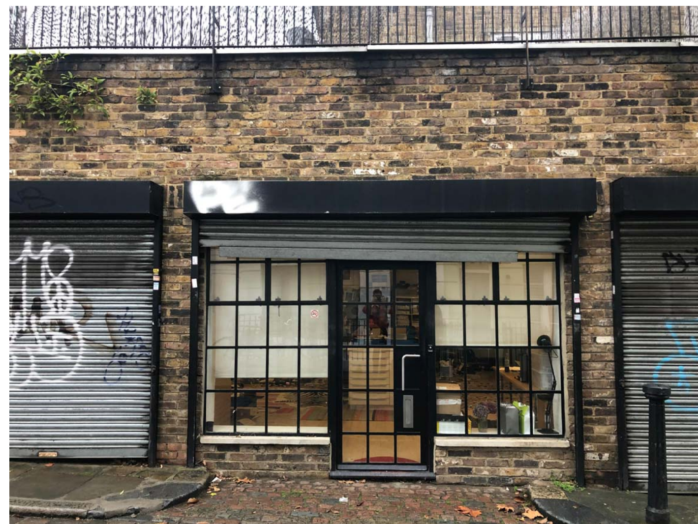
EXISTING OFFICE FRONTAGE

DO NOT SCALE FROM THIS DRAWING The contractor shall check and verify all dimensions on site and report any discrepancies in writing to the architect before proceeding with work.