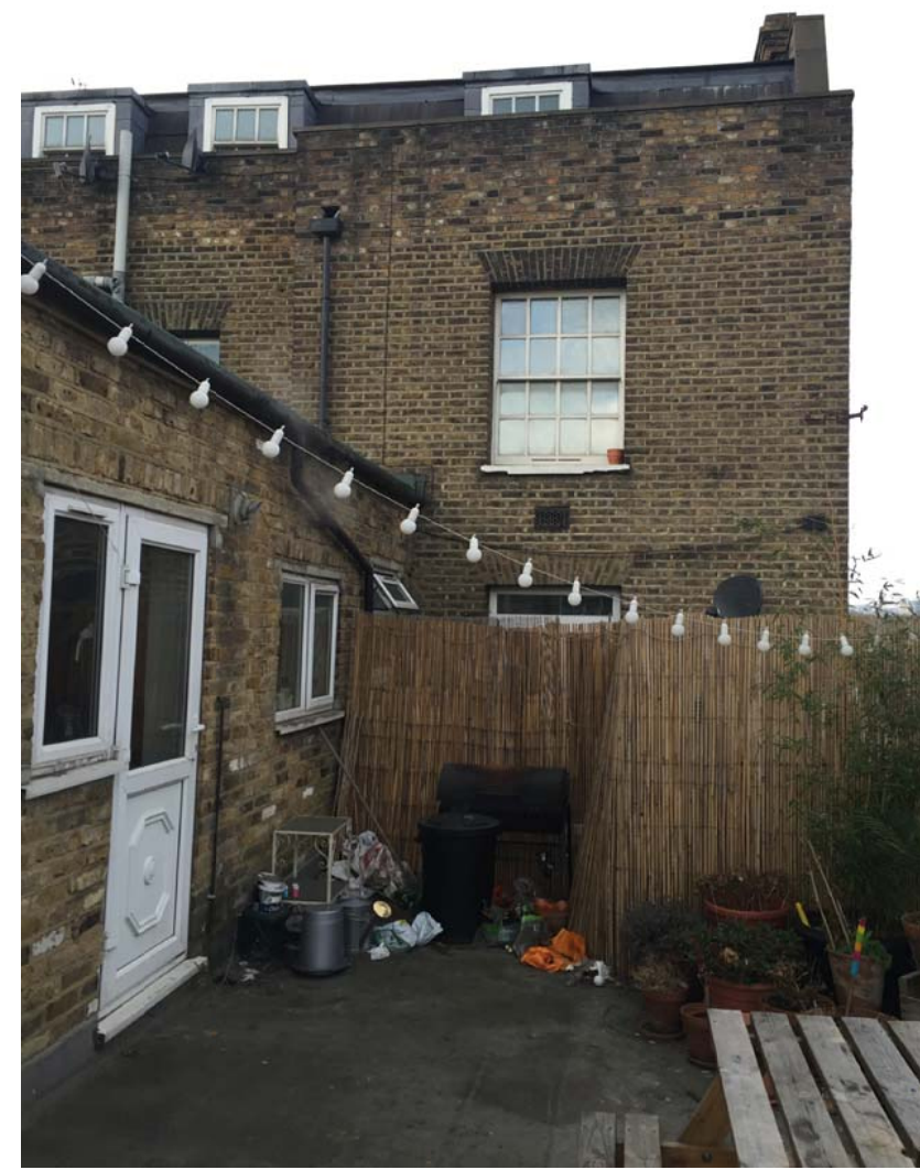
EXISTING TERRACE AND EXTERNAL DOOR