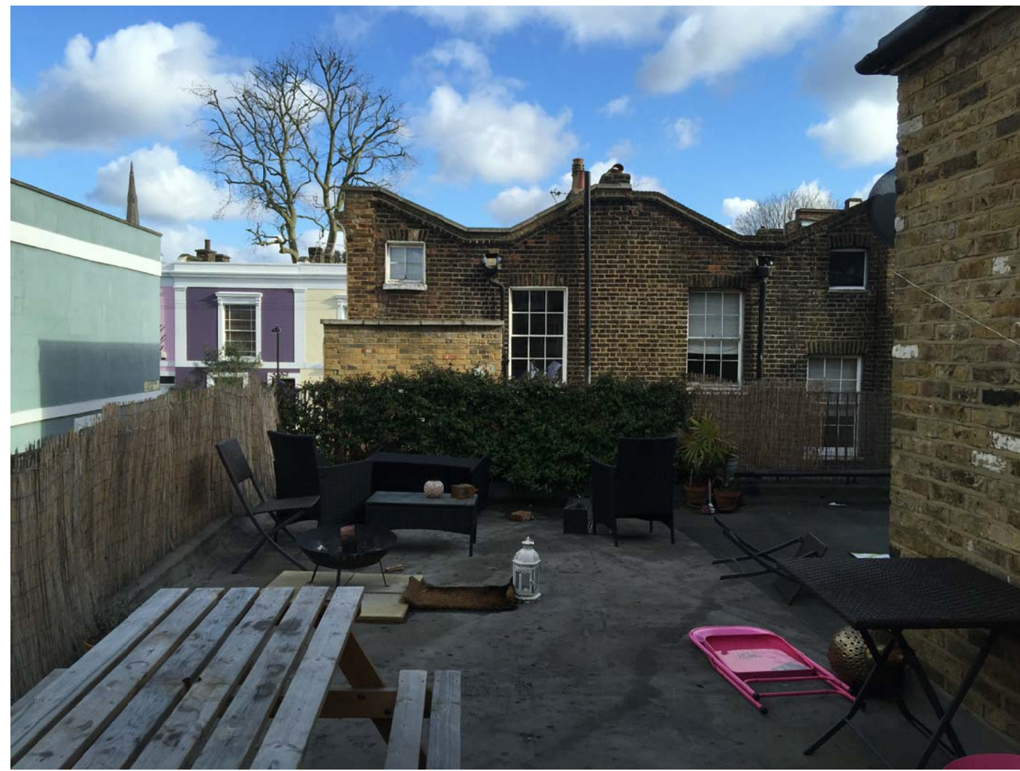
EXISTING TERRACE LOOKING EAST