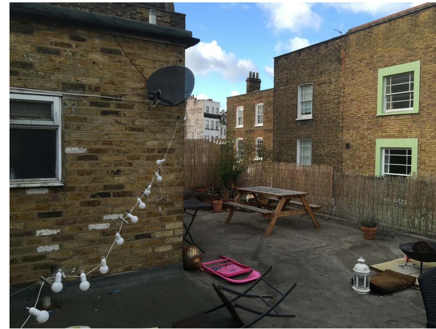
EXISTING TERRACE LOOKING SOUTH - WEST