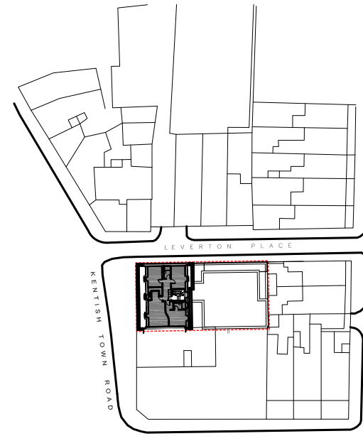
LOCATION PLAN 1:1000