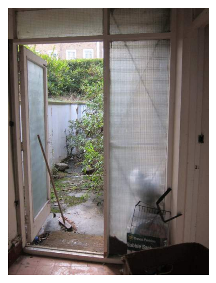
View from entrance hall towards garden