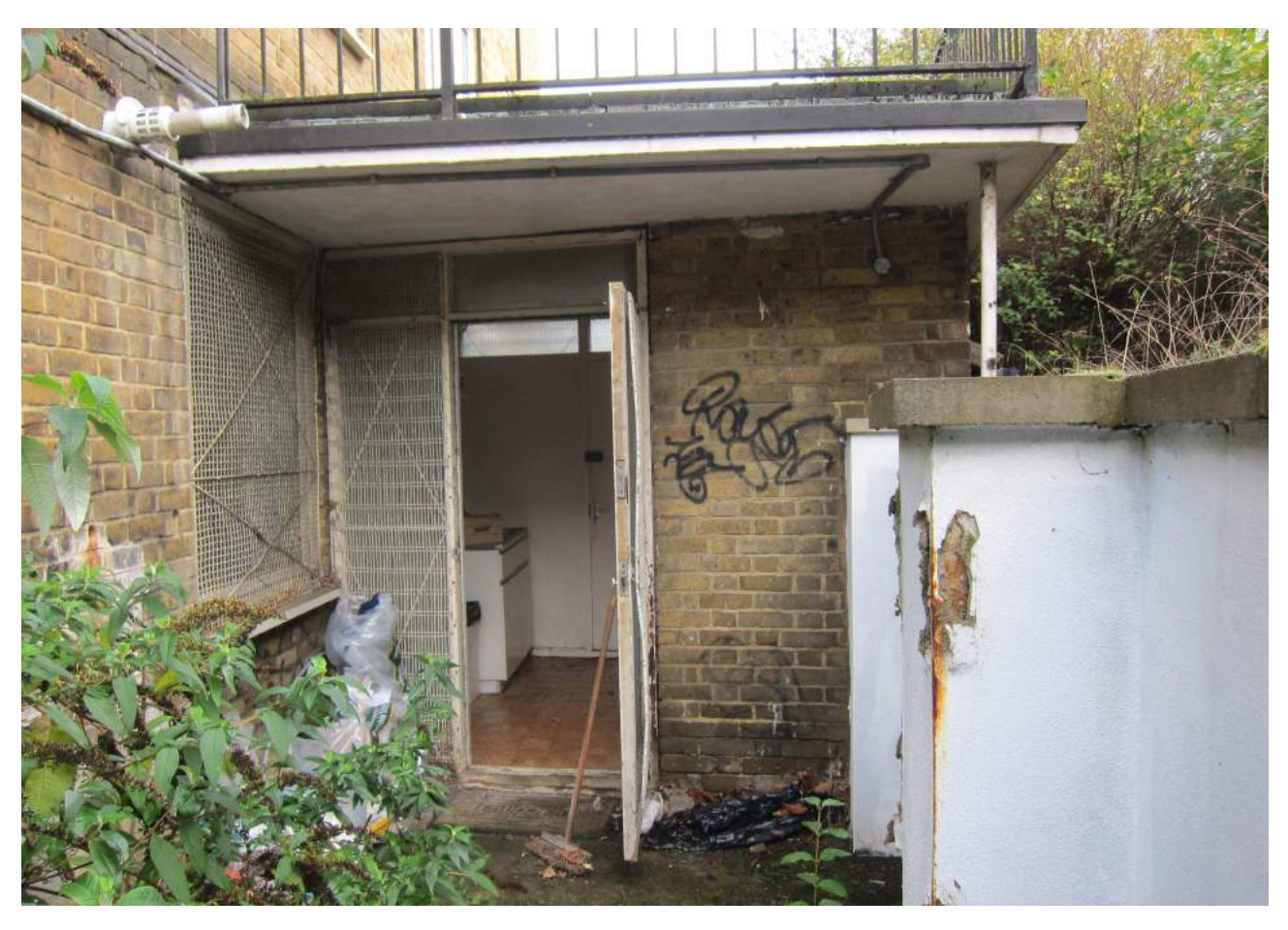
View from garden looking eastwards, with glazed door + screen to entrance lobby (to be infilled)