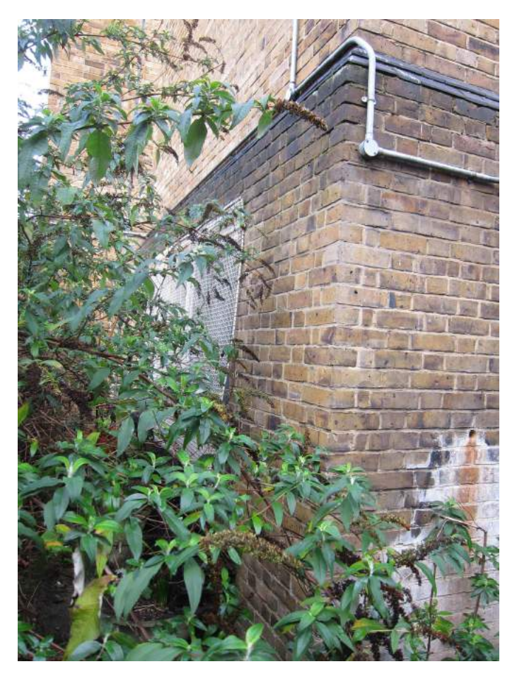
View towards window in west elevation (garden overgrown)