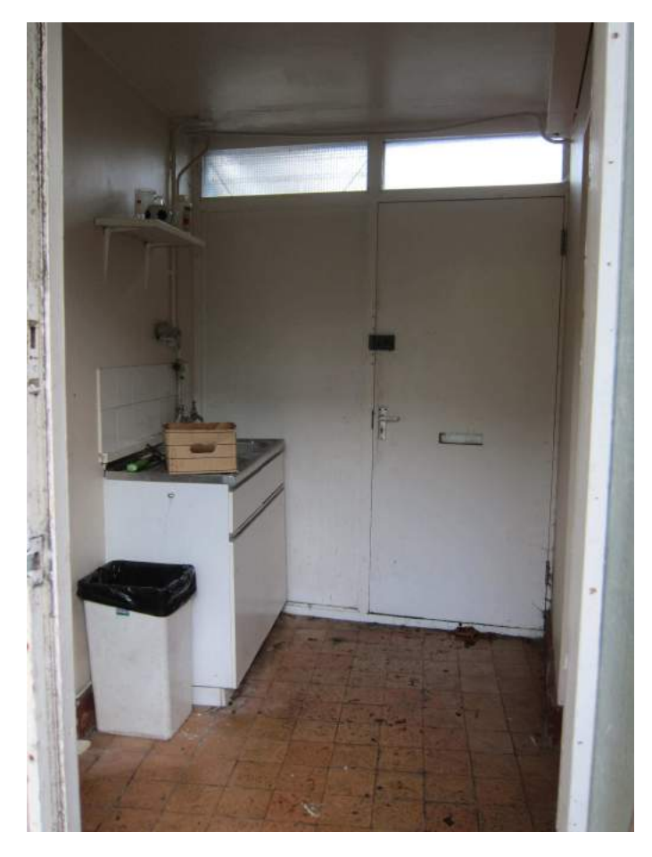
Entrance hall from rear garden looking towards entrance door