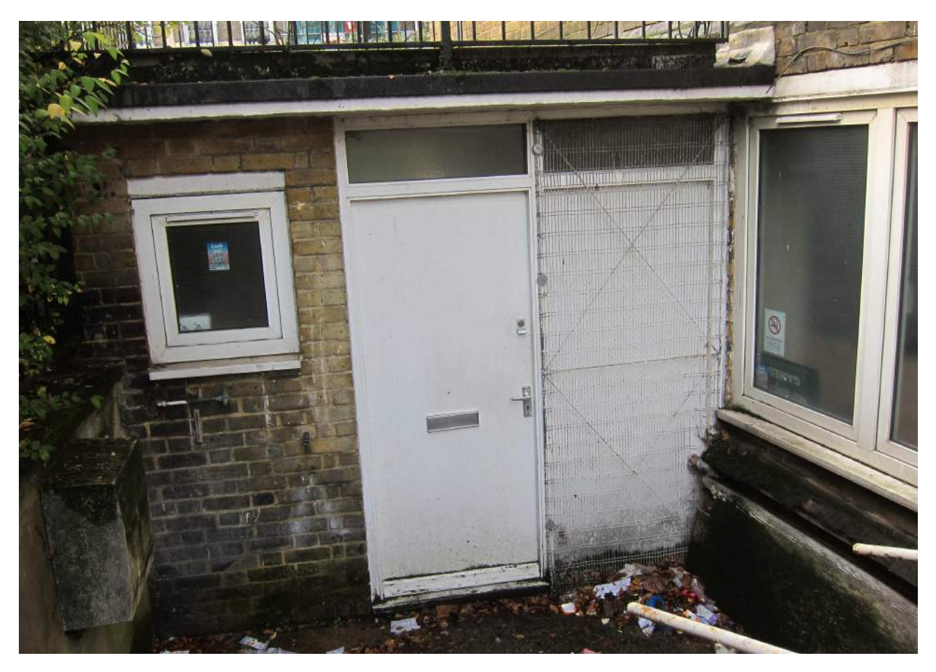
Existing entrance door and glazed screen (painted) from steps down