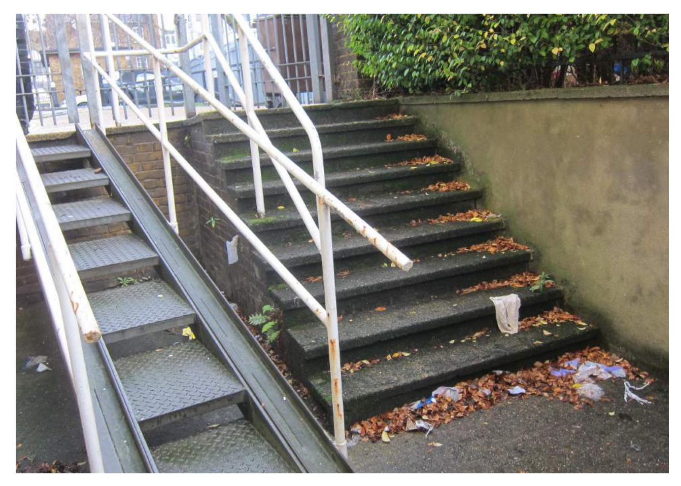
Entrance steps and wheelchair ramp (to be replaced by external platform lift)