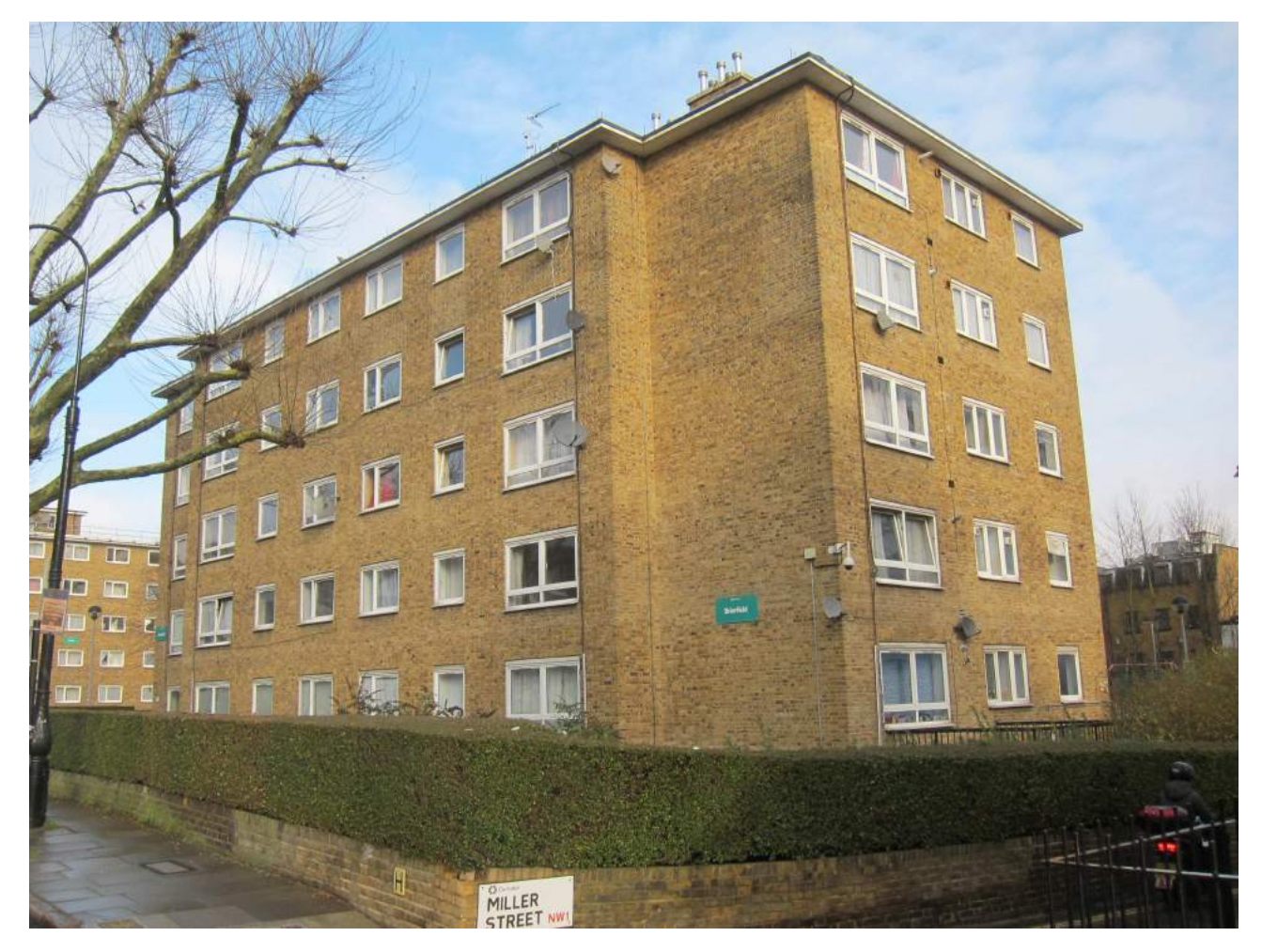
Brierfield from Arlington Road - community hall in basement at right-hand end of block