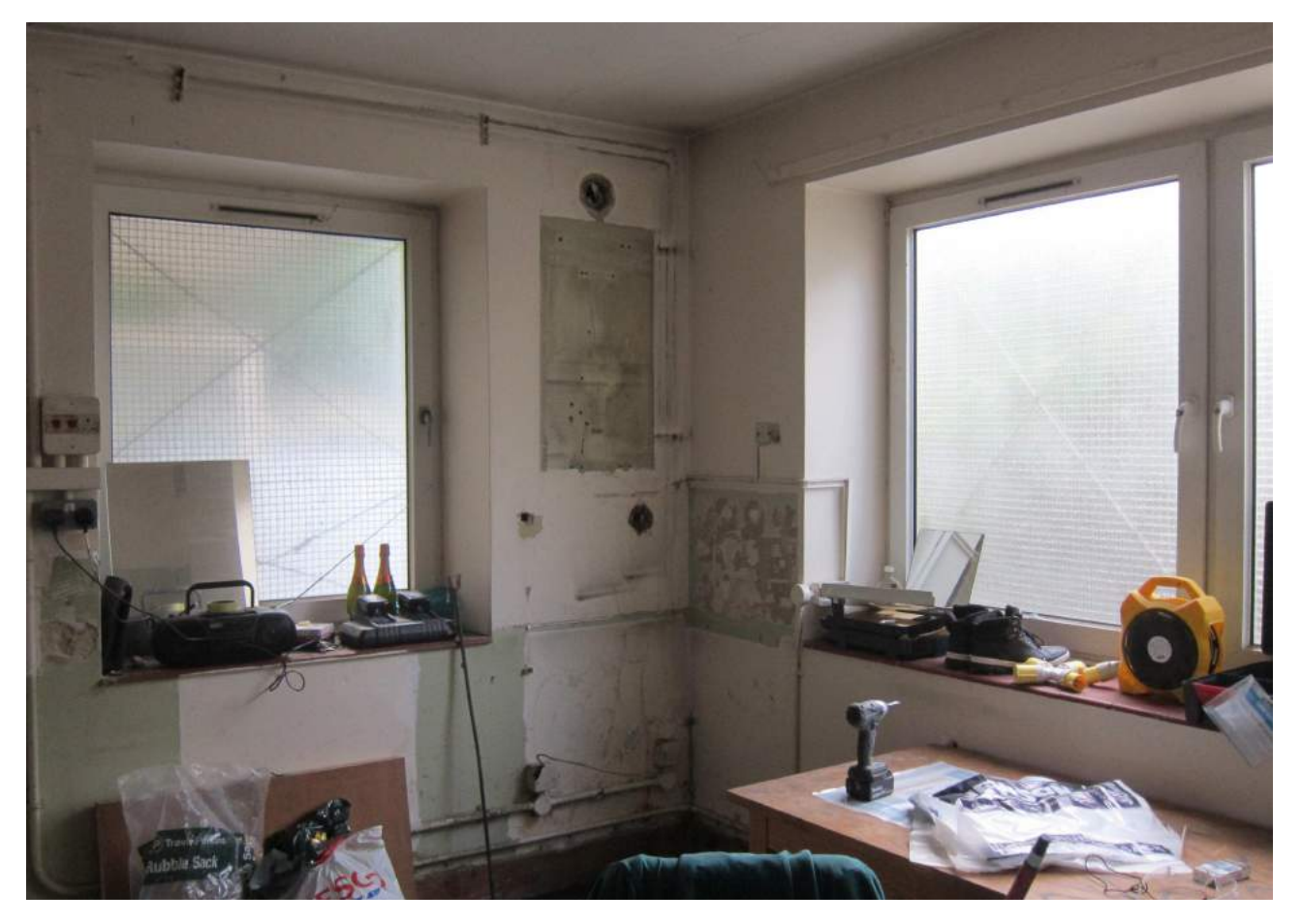
Community hall, looking south west - boiler + kitchen fittings removed, frosted glass to windows