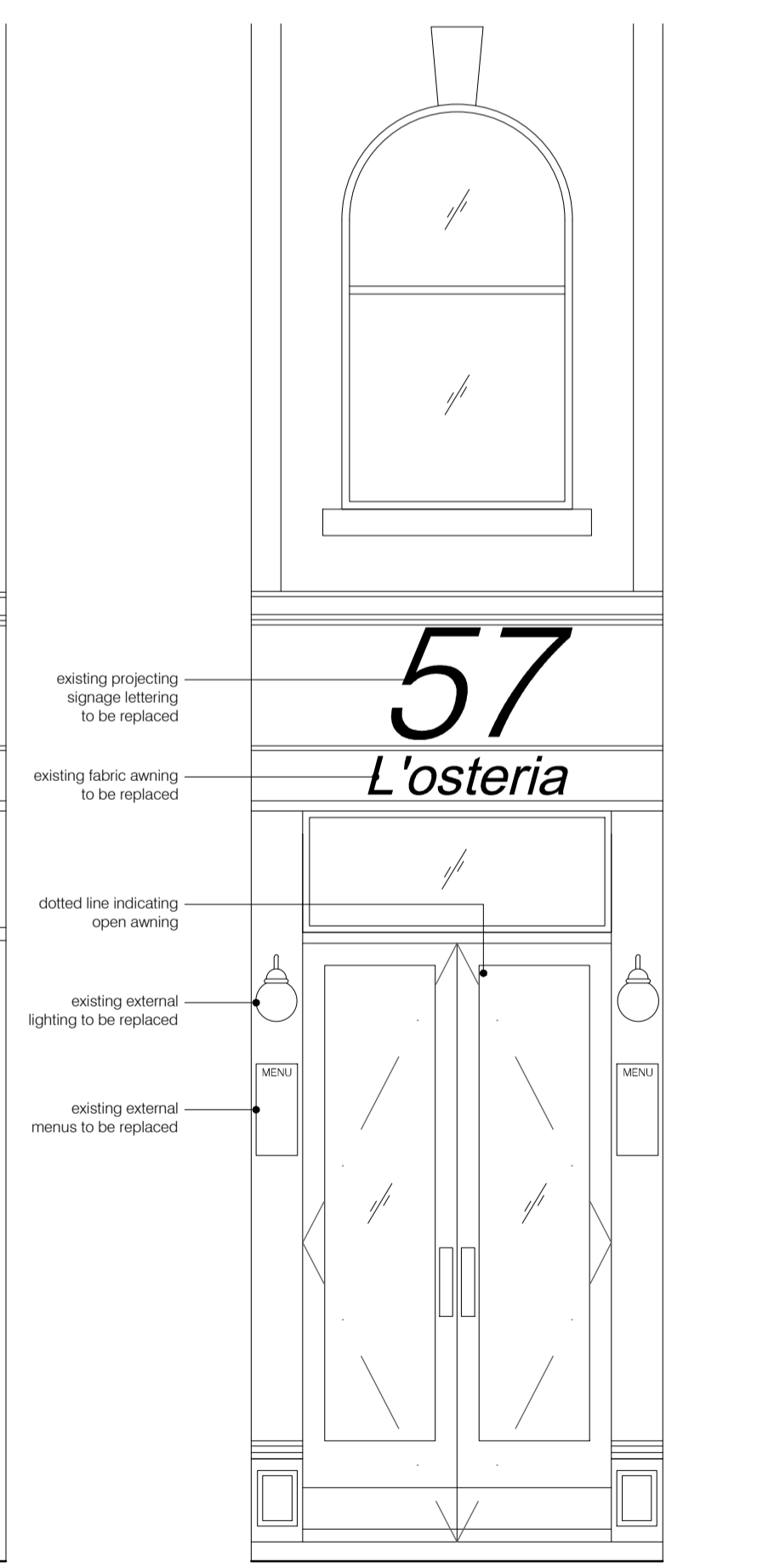
04 EXISTING ELEVATION 02 scale 1:25