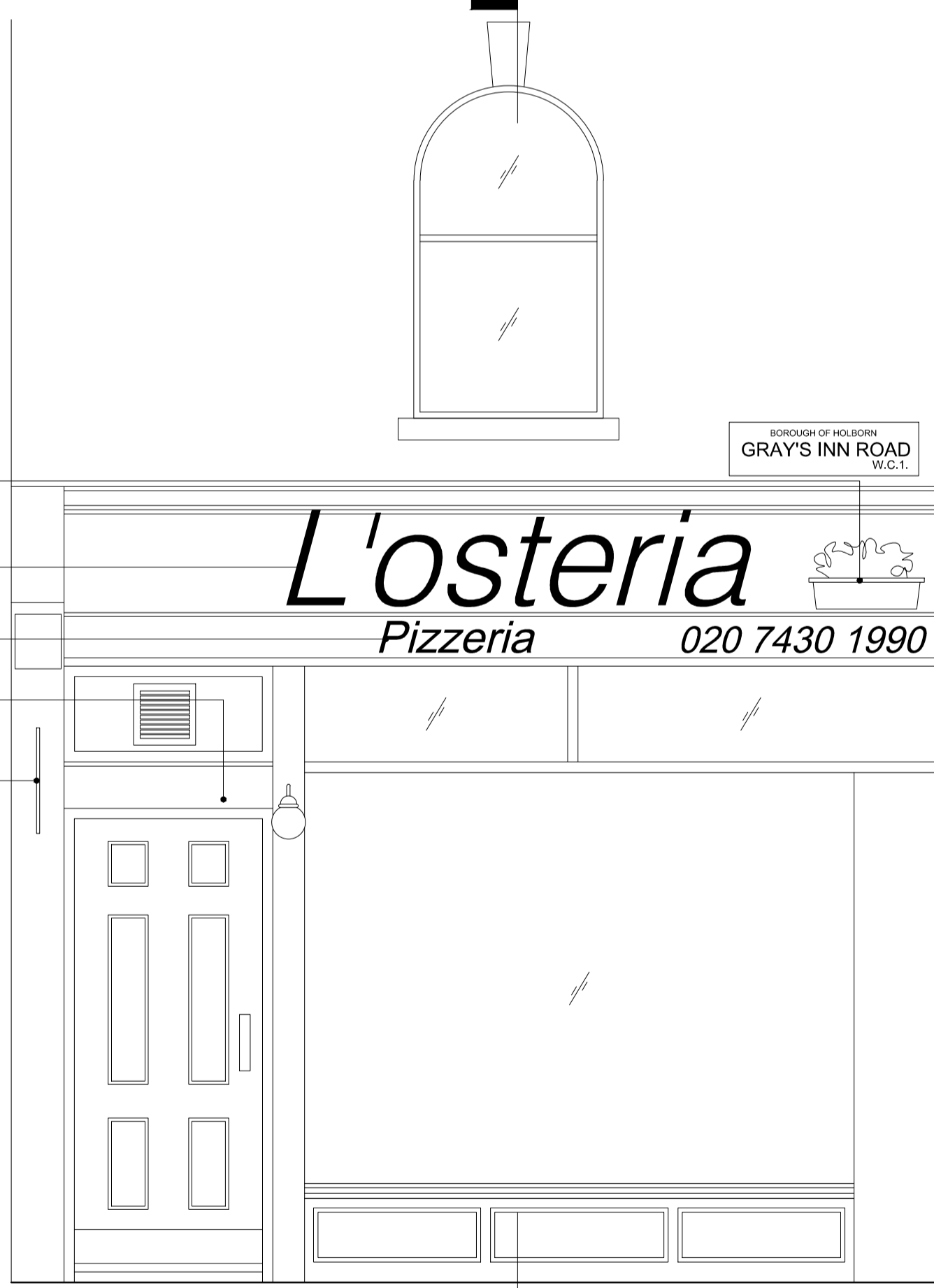
03 EXISTING ELEVATION 01 scale 1:25