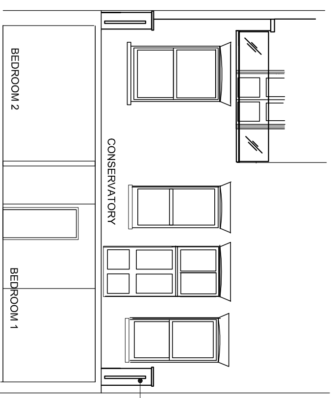
BASEMENT AND LOWER GROUND SHORT SECTION BB AS EXISTING