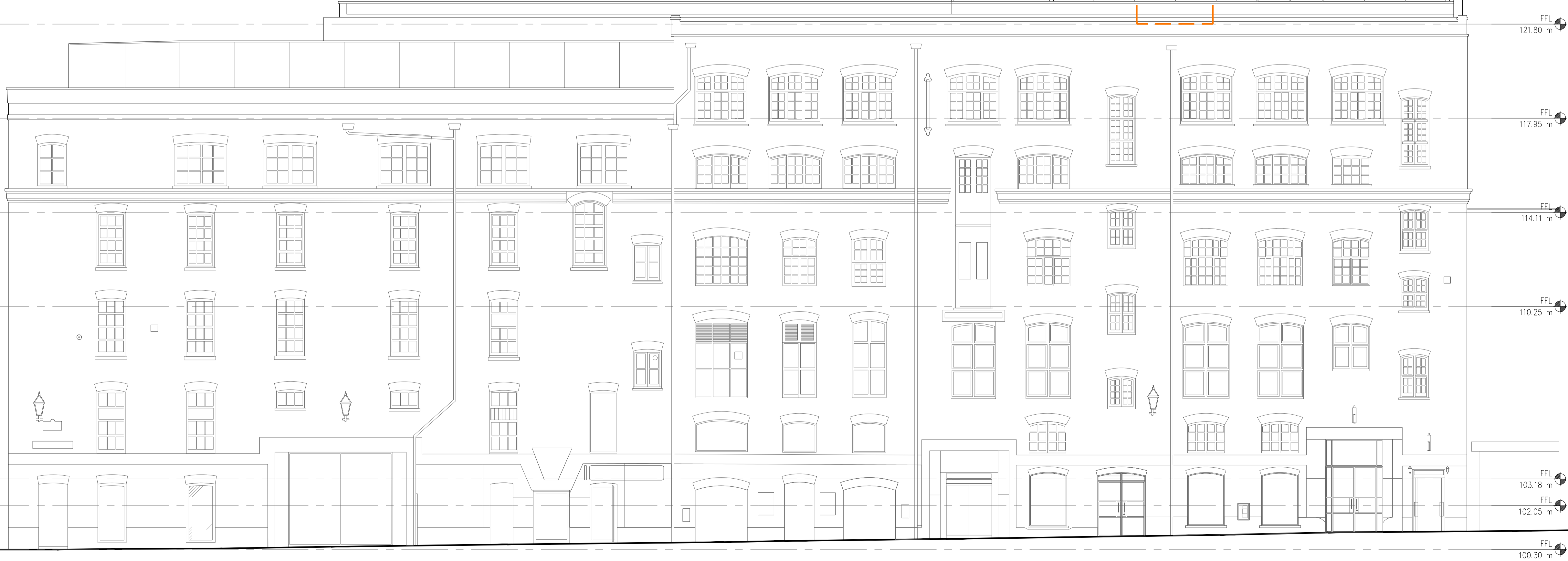
2 EXISTING ELEVATION - EARLAM STREET 1 : 100