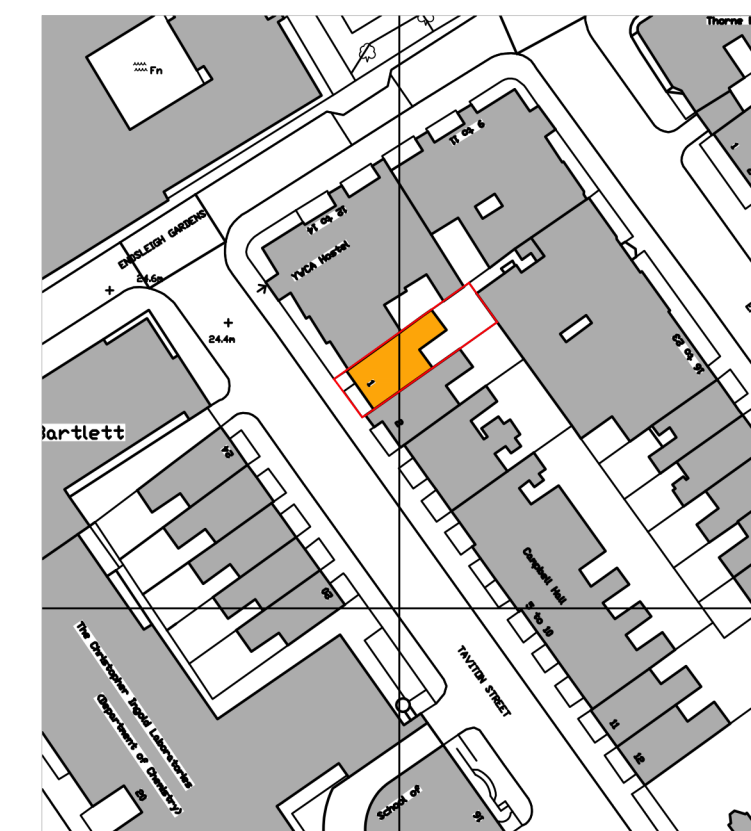
2 Location Key Plan Scale: 1:1250