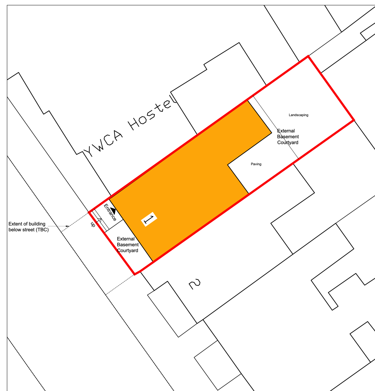
1 Site Plan Scale: 1:200

All illustrated material is subject to copyright unless otherwise agreed in writing. This document must be read for the express purpose and project for which it has been created and delivered and must be read with relevant specification clauses.