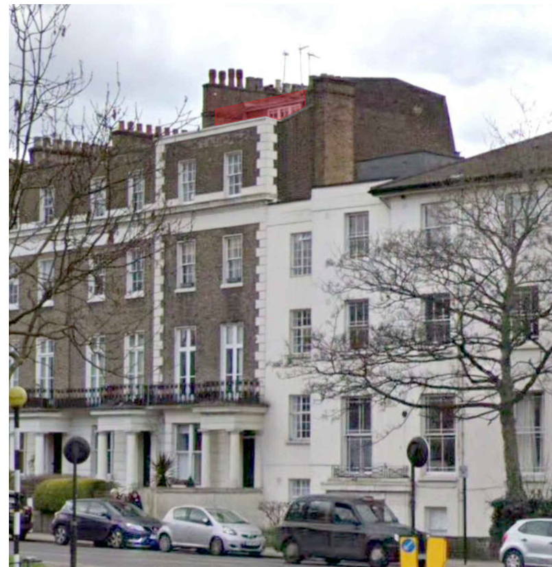
4 PICTURE No. 1 AFTER (illustrative)