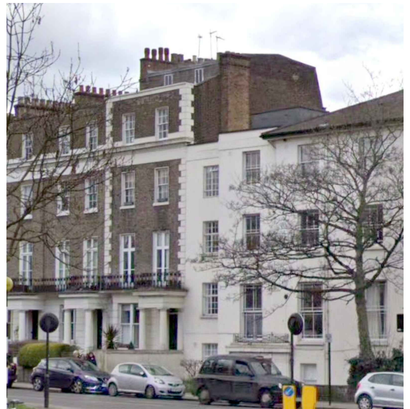
5 PICTURE No. 1 AFTER (illustrative)