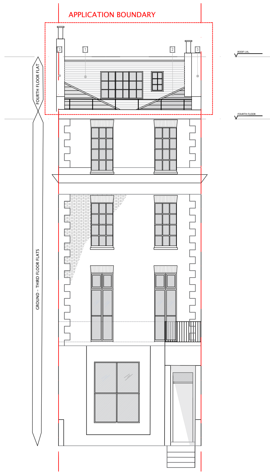
3 FRONT ELEVATION EXISTING 1:100