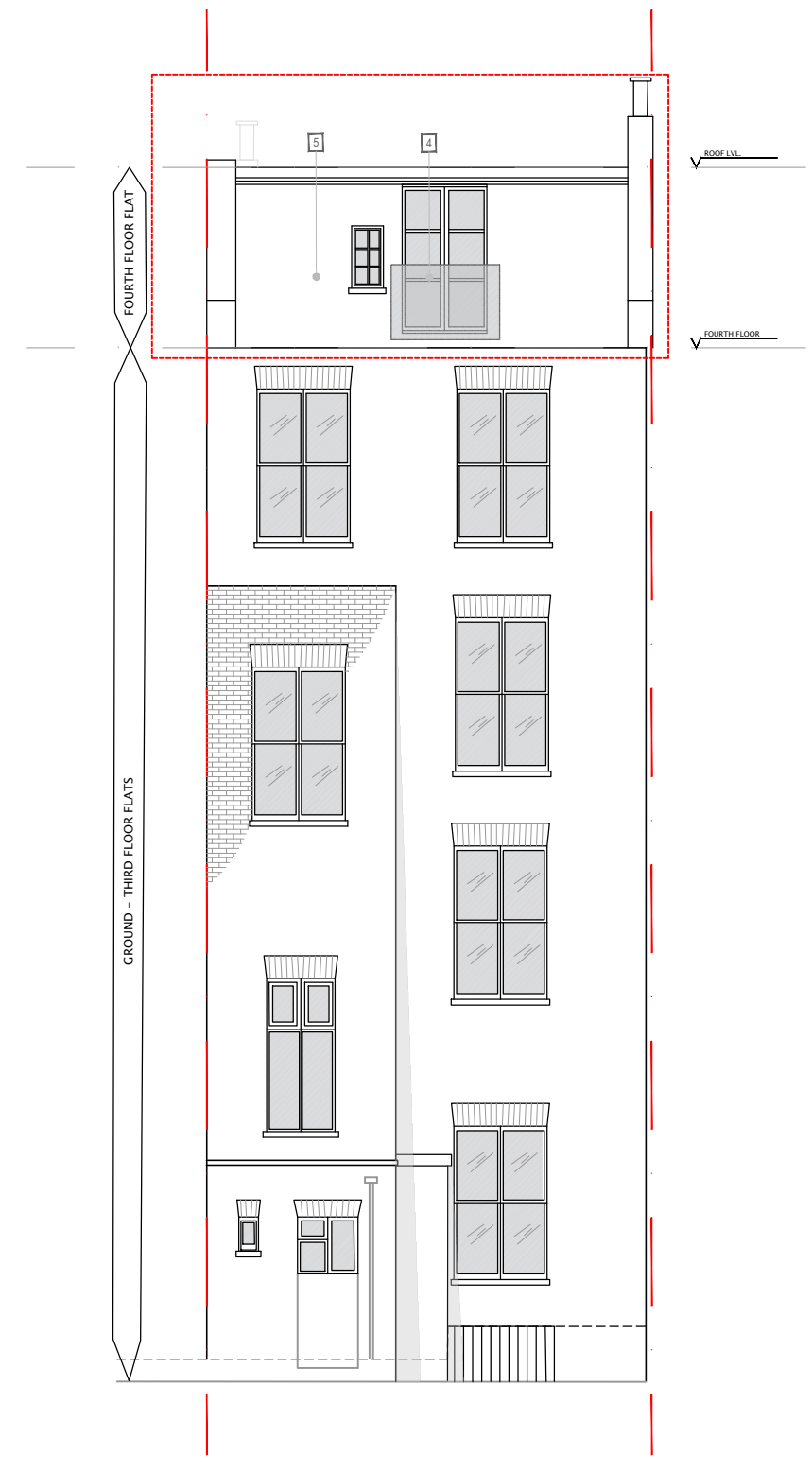
4 REAR ELEVATION EXISTING 1:100