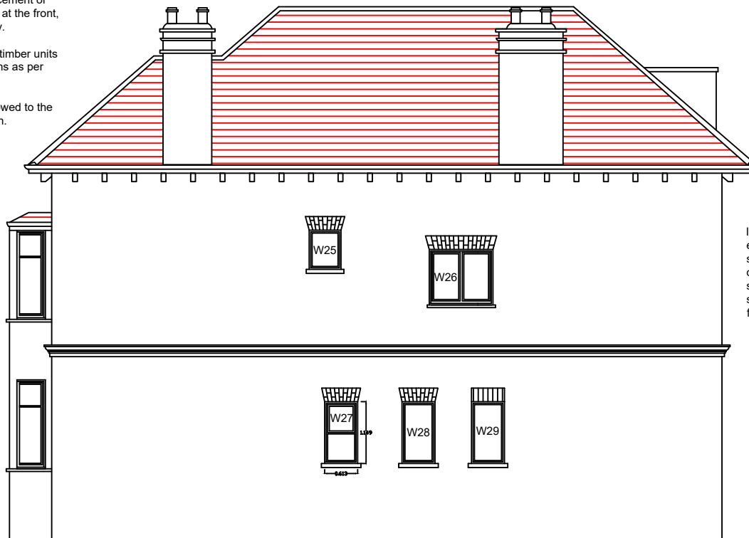
SIDE ELEVATION (Proposed)

PROPOSED ARE TIMBER WINDOWS SLIMLITE DOUBLE GLAZED TO MATCH EXISTING