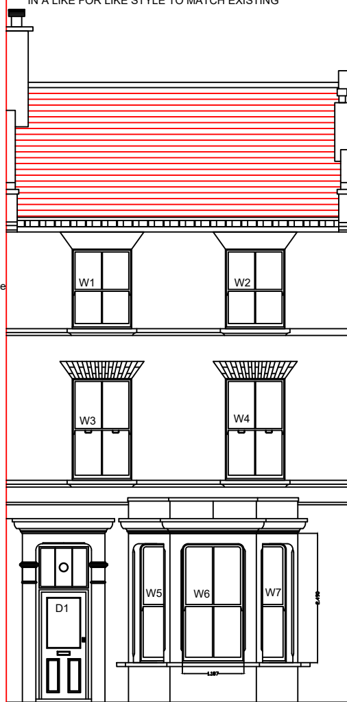
FRONT ELEVATION (Proposed)

PROPOSED ARE TIMBER WINDOWS WITH SLIM LINE DOUBLE GLAZING IN A LIKE FOR LIKE STYLE TO MATCH EXISTING