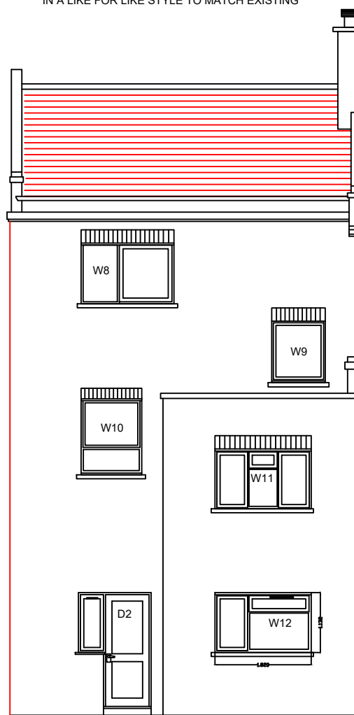
REAR ELEVATION (Proposed)

PROPOSED ARE TIMBER WINDOWS WITH SLIM LINE DOUBLE GLAZING IN A LIKE FOR LIKE STYLE TO MATCH EXISTING