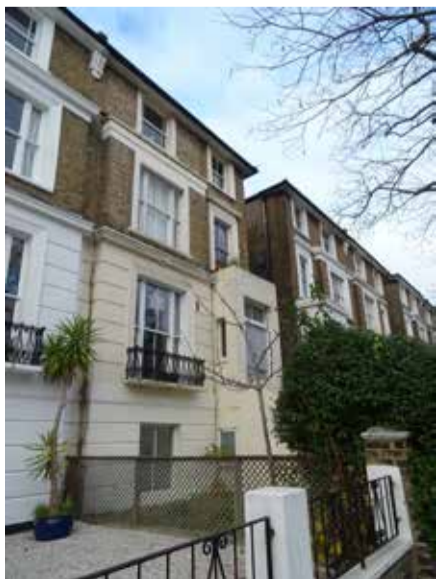
Brick extension to match existing brick.