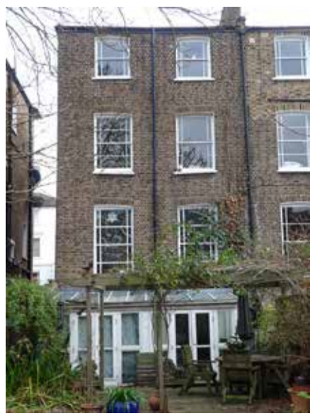
Brick extension to match existing brick.