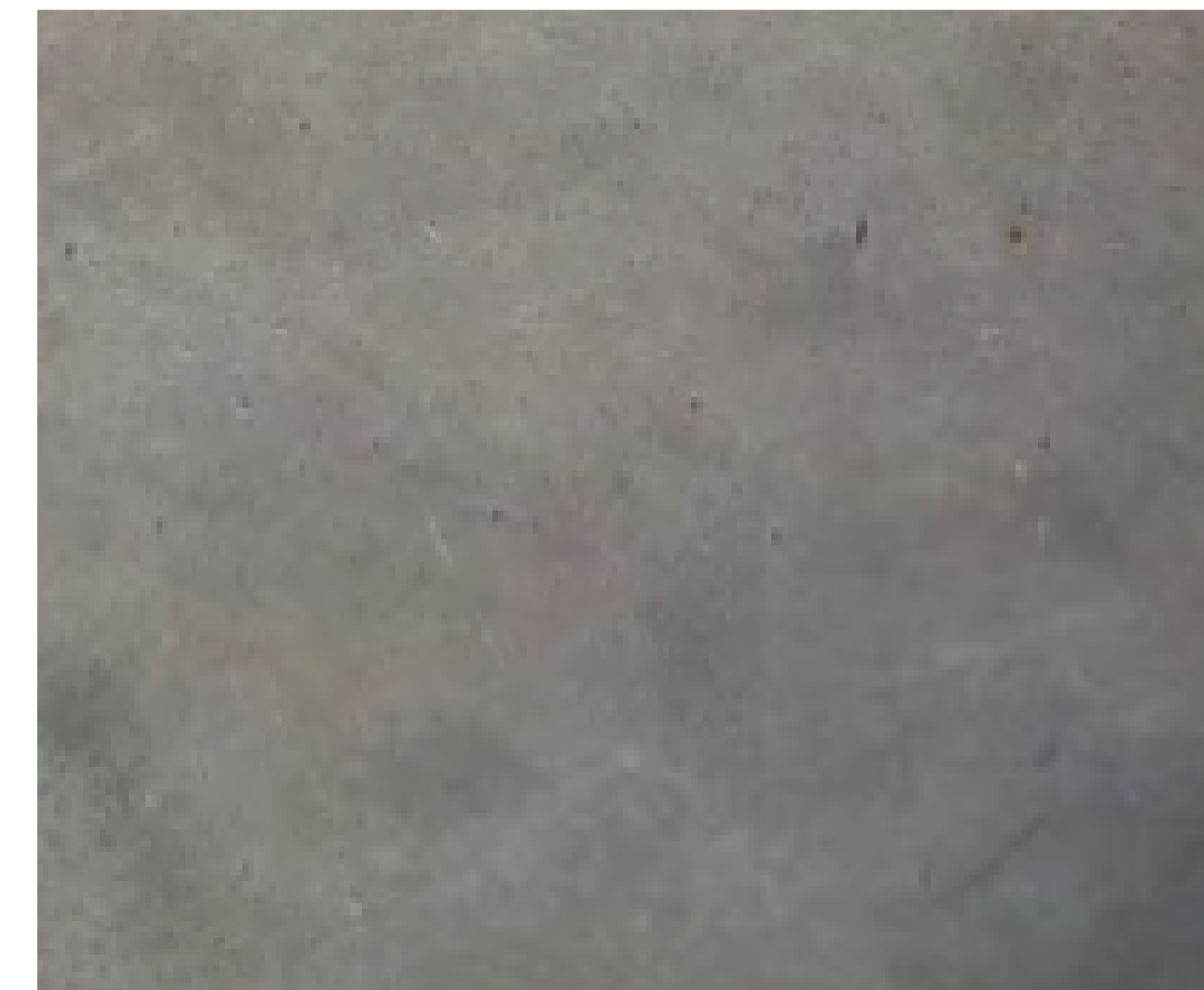
REFERENCE IMAGE - CONCRETE FINISH