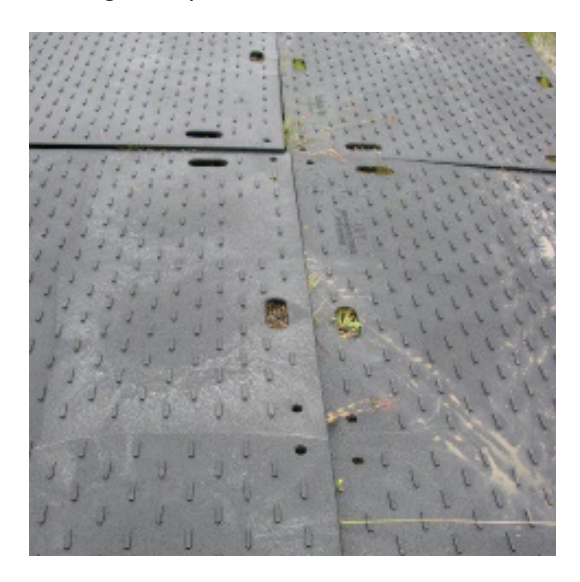
Aluminium temporary road way