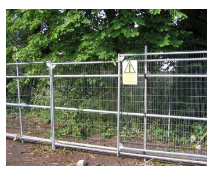
Figure 3 - Example of suitable warning sign affixed to protective barrier