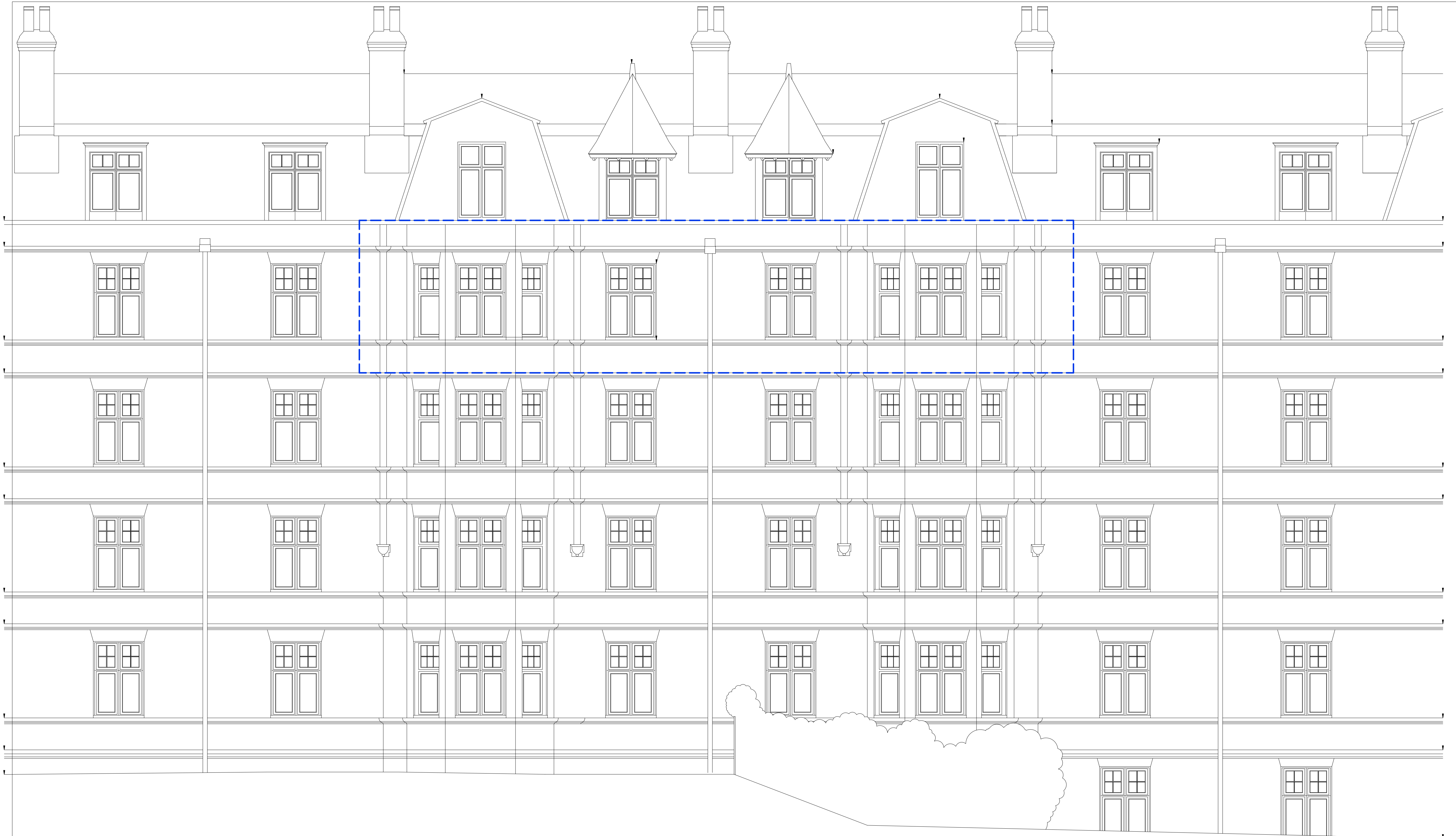
2 North Pryors Block South Elevation - 24 The Pryors in blue 1:50 @A1