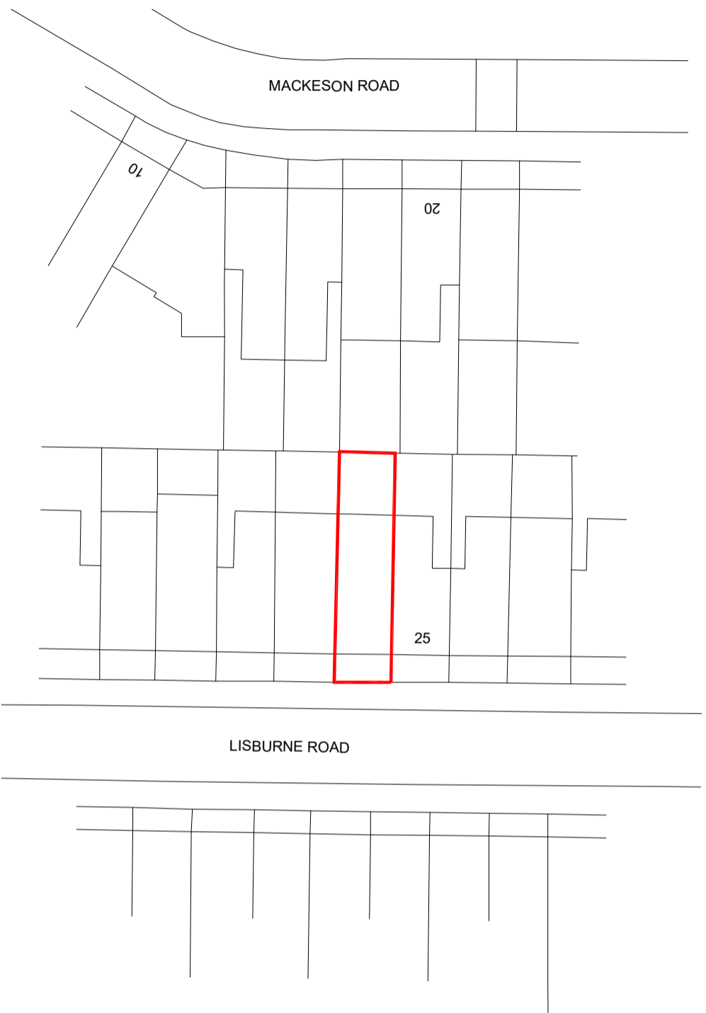
BLOCK PLAN 1:500