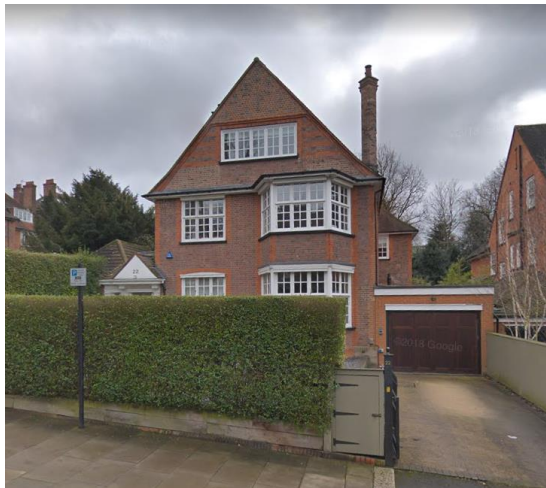
Front (street) elevation

The property is a 3 storey period detached house c1910 red brick with clay tiled pitched roof and Georgian style windows and doors. The garage appears as a later extension with felted flat roof. The garage is not character with the original house.