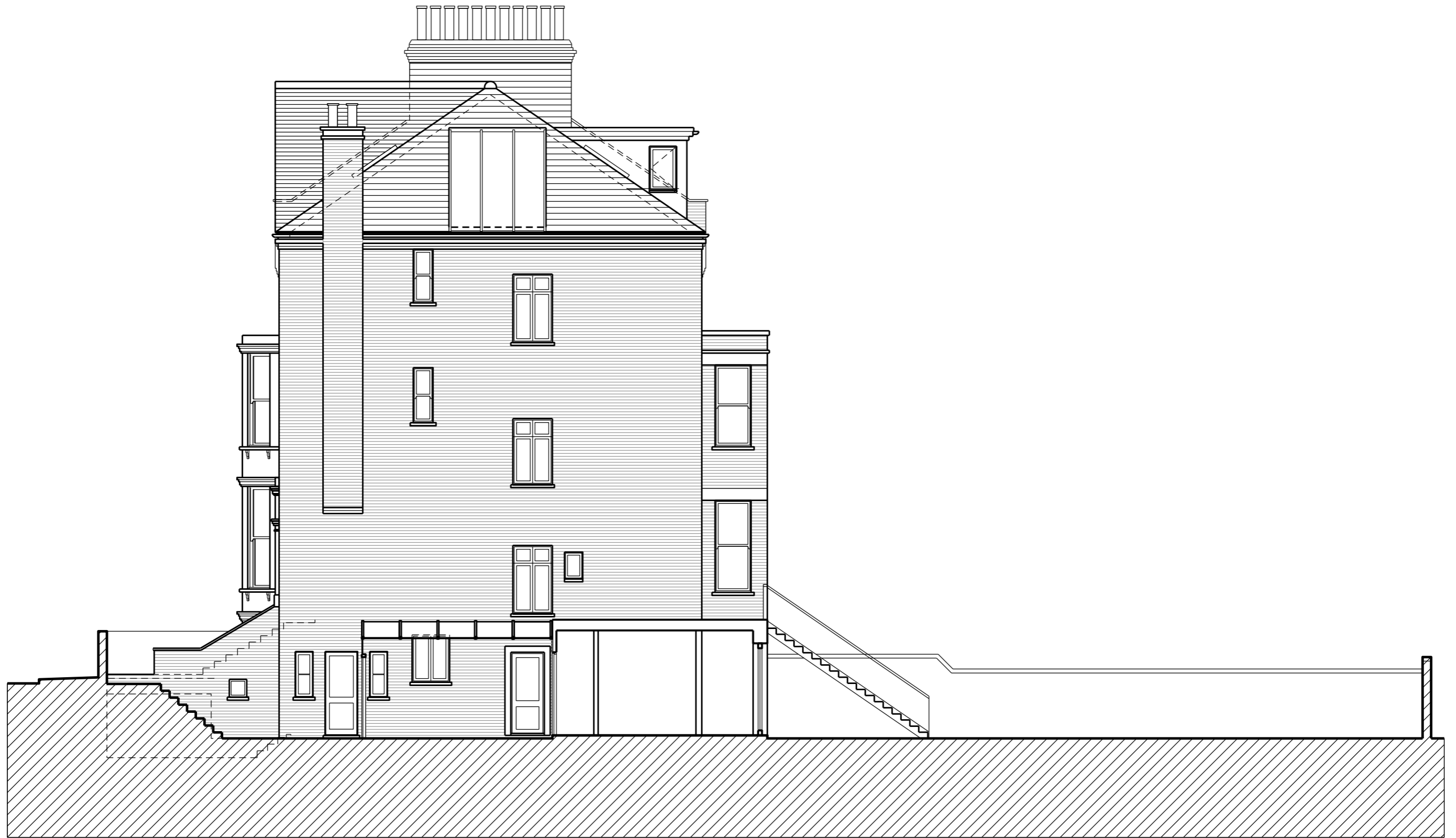
01 Proposed Side (SE) Elevation Scale 1:100